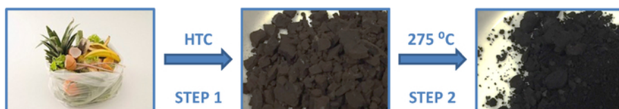
Figure 1: Schematic description of the protocol.

analytical conditions. This corresponds to a reduction of volatile content of 17.5 percentage points with respect to raw hydrochar. After treatments at 250, 275 and 300 °C, the corresponding mass loss was 6.01, 5.17, and 4.22 wt% of the total mass, respectively. It can be concluded that the treatment at 200 °C removed 50 wt% of these volatiles, and the one at 250 °C removed more than 80 wt%. Further temperature increase induced only small changes.