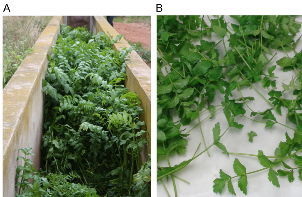
Figure 1 Plant of fool's watercress. (A) Wild population growing in an irrigation ditch. (B) Sample representing the edible part of this plant. Author: C. Guijarro-Real