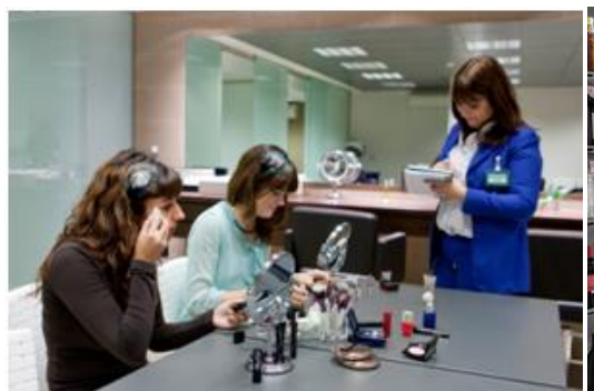
Figure 3. Action in the personal care center (left) and view of the Canary Islands center (right)

In 2018 the co-innovation experiments were redesigned and a new type of co innovation center was launched in Valencia. With almost 6,000 sq. meters and an investment of 3,5 mill. Euros it includes a supermarket and a home setting area. Co innovation sessions are carried out there but also training of new employees in a real shop context. In this way, in a single point, the entire product development process can be carried out and managed, from the start to its final launch in the real stores and, at the same time, implementing decisions on the assortment and on the sales space. In these new centers retailers may be included from the very beginning of the process.