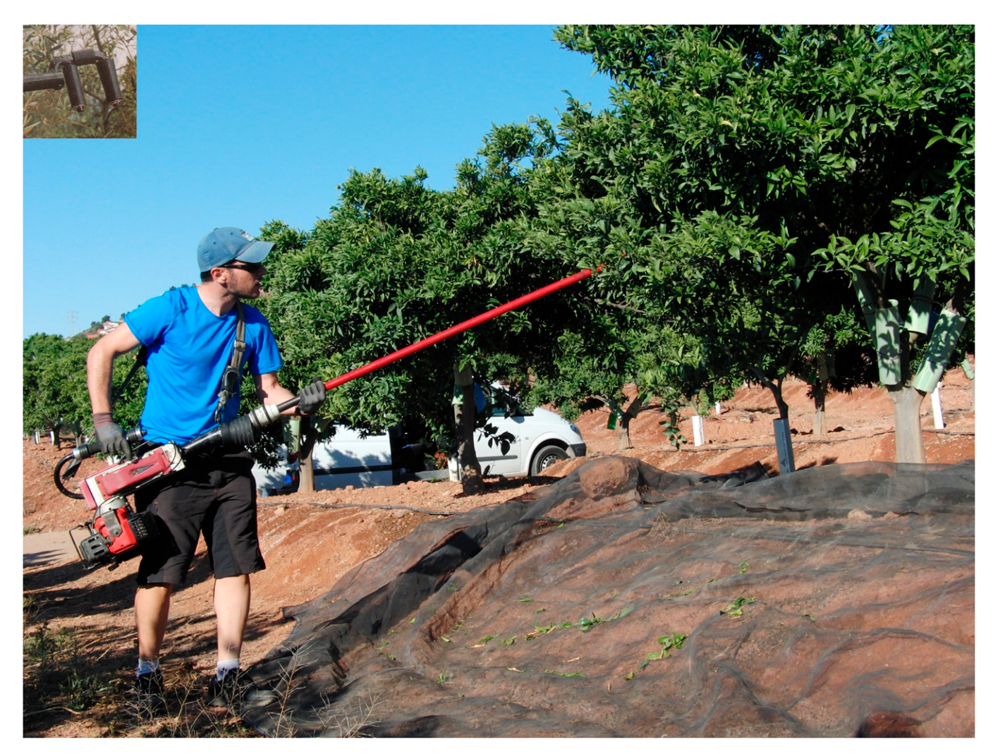
Fig. 1. Hand-held gasoline-powered shaker used for the mechanical thinning of 'Clemenrubi' mandarin and the details of the hook (upper left).

and year) and two variables were measured at harvest [individual fruit weight (grams per fruit) and fruit yield by weight (kilograms per tree)]. The first variable is referred to as "final fruit size," and the second variable is referred to as "final fruit yield." For the variable final fruit yield, the experimental unit was the tree. However, for the variable final fruit size, the experimental unit was the fruit; a sample of 50 randomly selected fruit were tested from each tree. A two-way analysis of variance (ANOVA) was performed to assess the effects of the thinning method and the year on the final fruit size and final fruit yield. Tukey's honestly significant difference test intervals were used to compare the mean values of final fruit size using the three thinning methods (mechanical thinning, manual thinning, and no thinning). In addition, during the