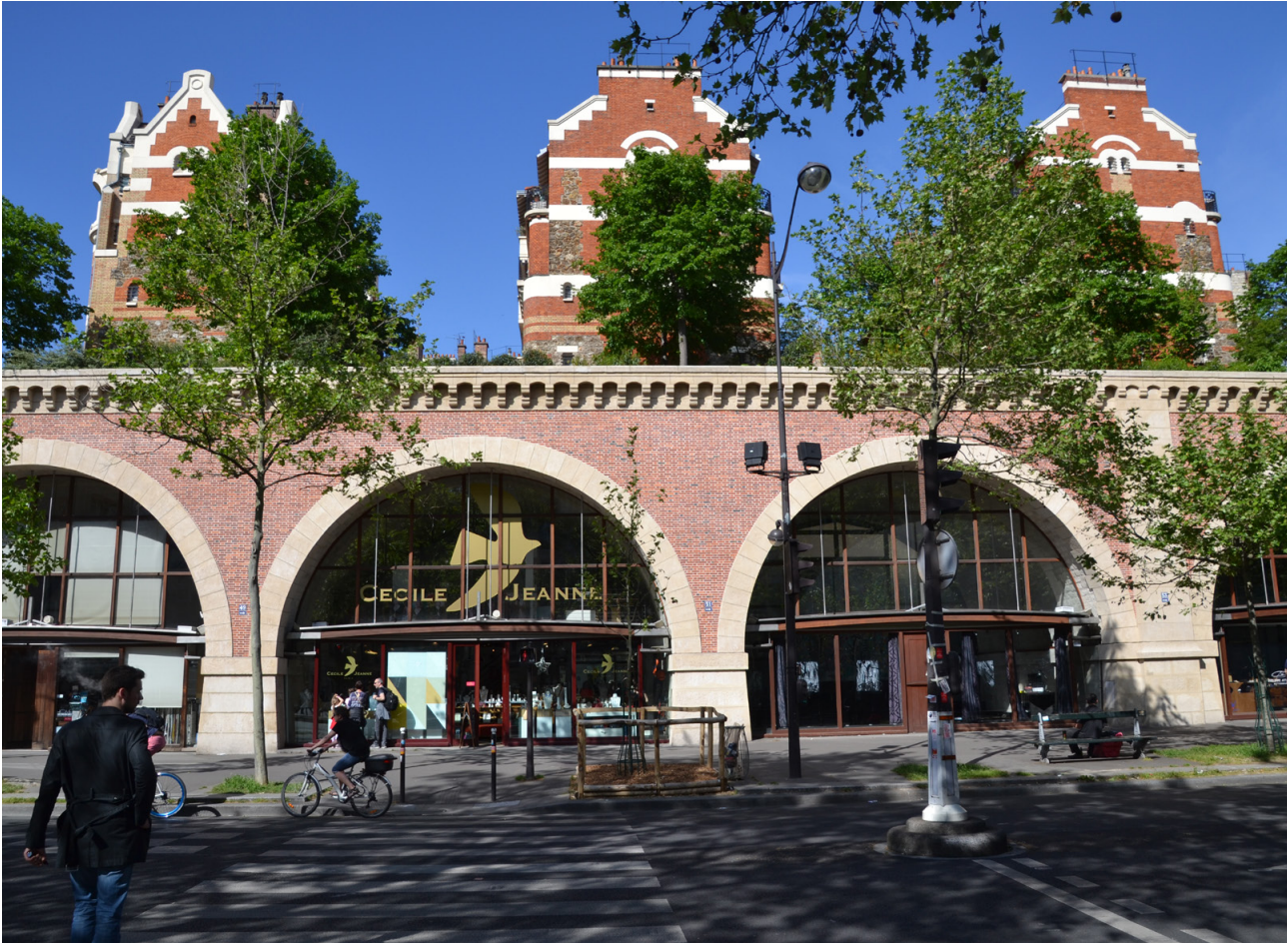
Figure 6 | . Promenade Plantée Viaduct.

The Musée d'Orsay analysis focus on the reuse of a railway building that lost its former function and was reconverted into a space for artistic manifestations, “contributing to regenerative spatial and urban planning” (ESPON, 2020). Its reconversion avoided the construction of a new building, reducing the waste disposal, and the need for a new contingent of raw materials or the consumption and transportation of new construction materials.