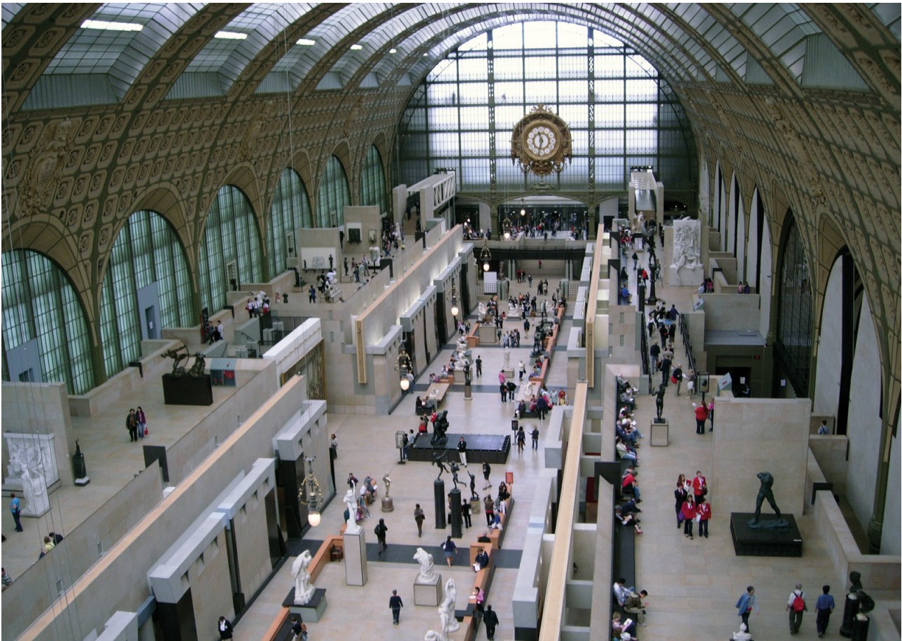
Figure 2 | View of the nave of the Gare d'Orsay converted into the Musée d'Orsay.

Paume Gallery was supposed to be found. With this decision: