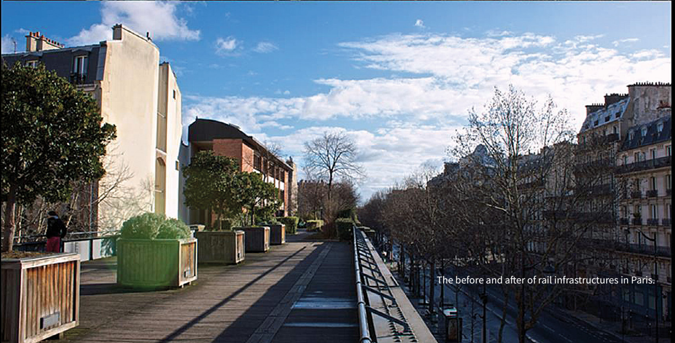
The before and after of rail infrastructures in Paris.