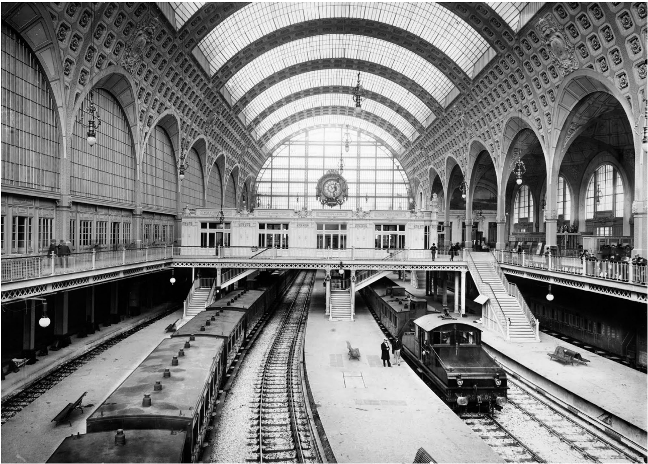
Figure 1 | View of the nave of the Gare d'Orsay.

It cannot be stated that this survey has a direct relationship with the most used ways of preservation in the country, as there is a wide variety of railway heritage buildings reconverted to other uses. On the contrary, we can affirm that the recognition of this infrastructure has fostered the preservation of several buildings. However, the concern with the urban landscape was also a reason for the versatility of the reuse projects implemented, a subject that cannot be disregarded.