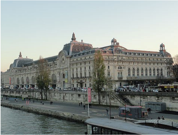
Figure 3 | Musée d'Orsay.