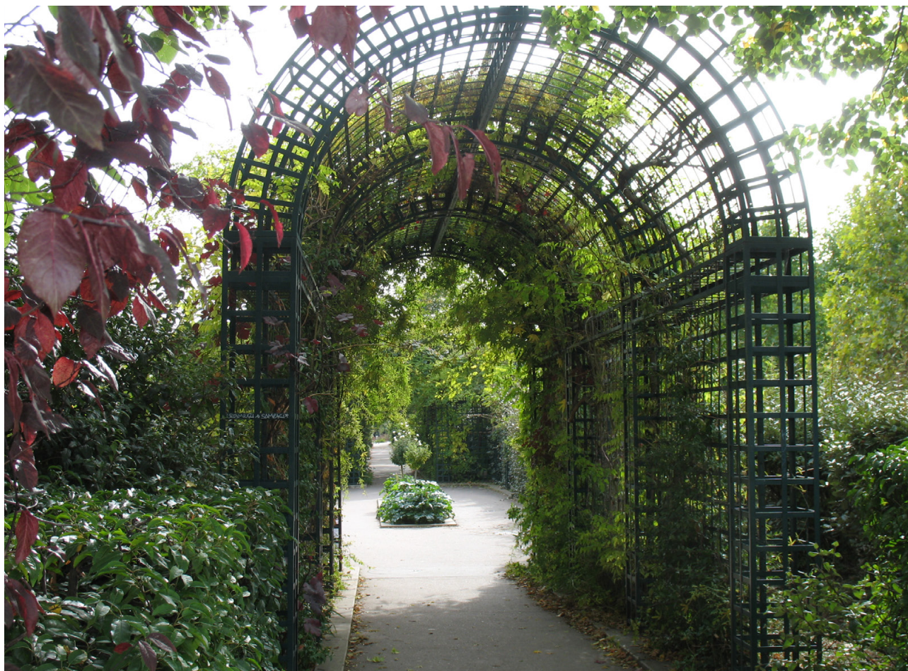
Figure 5 | . Promenade Plantée .

Therefore, unlike the Gare d'Orsay , its building was not valued as an architectural monument, giving way to the new building of the "Paris Opera", inaugurated in 1989, occasioning the disposal of waste from the demolition of an old building and the use of new materials for the construction of a completely new one on the same site.