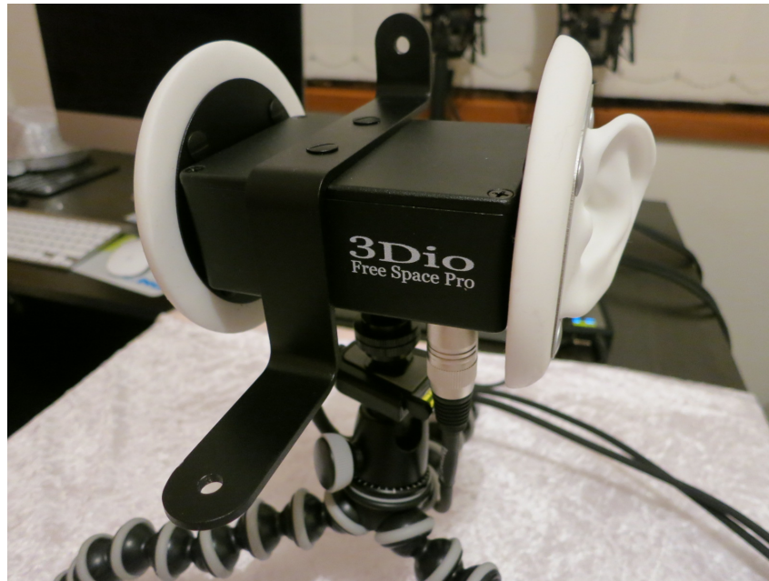
Fig. 2. 3Dio's Free Space© device.

The method of recording binaural sound uses two microphones in a mock head with two ear-shaped pinnae, simulating the ear's natural position, creating an ear spacing or "head shadow" from the head to the ears. In fact, the student perceives Interaural Time Differences (ITDs) and Interaural Level Differences (ILDs). Adjustments (known as Head-Related Transfer Functions (HRTFs) are done automatically by the system itself. That means that sound is sequenced naturally as sound “involves” the human head and is adapted to the form of the outer and inner ear. The most often used commercial device is 3Dio Space Pro© developed 3Dio Company.