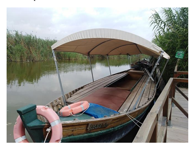
Figure 2. 2Touristic tour boat at El Palmar.

The study has been applied to the boats fleet used for touristic promenades at the district of El Palmar .