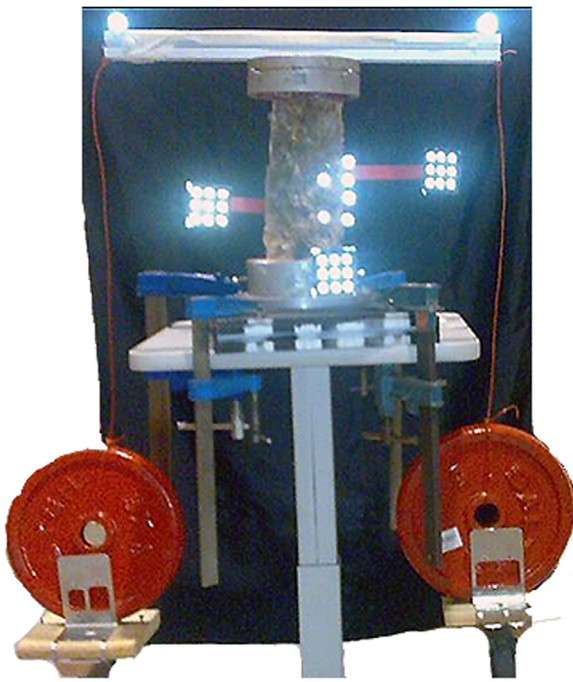
Fig. 1. Kinematic setup.