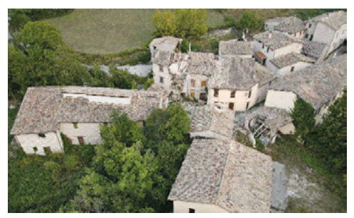
Fig. 4. Drone photography of Gabbiano and its landscape

Gabbiano is a small and rural settlement in the hamlet of Pieve Torina (Macerata district). Standing over a hill, the village is composed of eight buildings (with different private properties) and one church on a principal sinuous path axis (Fig. 4).