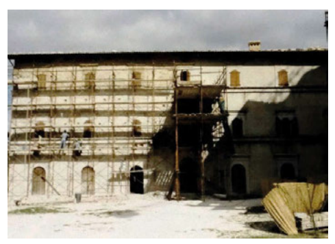
Fig. 3. Photography from 1988 testifying the presence of plaster on the Shrine façades

One of the main topics is the potential reintroduction of the plaster on the natural stone façade of Palazzo delle Guaite . Historic research, historical pictures (Fig. 3), and an accurate survey of the masonry stone suggest that the exterior aspect of that building was historically characterized by the presence of plaster. The reintroduction of plaster, in addition to FRCM (Fabric Reinforced Cementitious Matrix), would nowadays be a proper method to increase the mechanical resistance of the masonry and, concurrently, restore the historical appearance of the building.