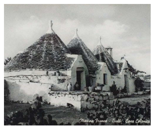
Fig. 6. The farmer's tool shed.

Rural buildings, then, but at the same time architectural devices, whose external and internal spaces were formed by the farmer, an emblematic and central figure of the entire production process, in which it is possible to bring together the roles of owner of the land, farmer, extractor and supplier of materials, builder and maintenance worker. (fig.6)