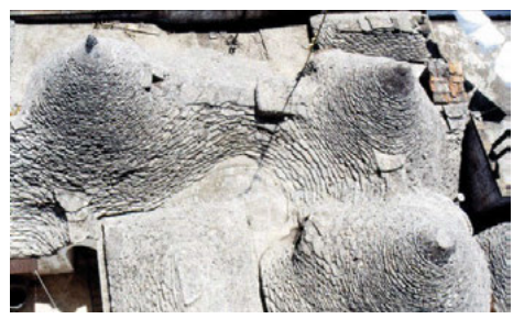
Fig. 5. Plastic solutions - without geometric regularities resulting from empirical knowledge of rainwater runoff.

The results of the research direct attention towards the need to survey dry stone constructions, before any type of intervention, as a fundamental moment for understanding the building in order to preserve its most characteristic aspects from a morphological point of view, as products of an established rural tradition capable of slowly and manually creating these irregular constructions marked by skillful joints and geometric mediations. One of the most collated reasons, which would justify these particular extradosal patterns, is to be found in the need to transport the rainwater from the roof into special internal and external cisterns, to be used as a water supply for the support of agricultural activities. (fig.5)