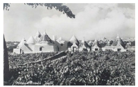
Fig. 1. Old view of the Idria Valley (1960?)

This situation, due to the lack of adequate urban planning tools, has progressively changed their original agricultural image. (fig. 1)