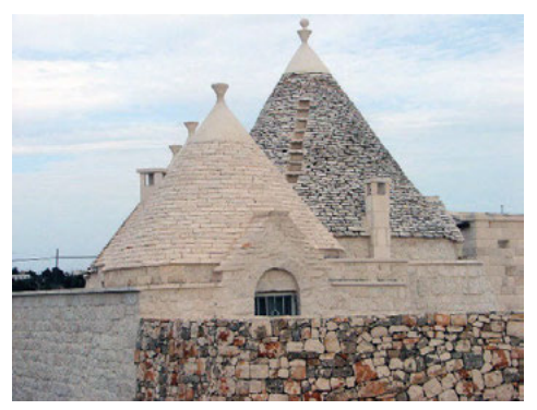
Fig. 2. Disassembly and reconstruction without preservation of original geometries

These were years when the absence of adequate urban planning instruments left a certain degree of autonomy to economic operators who were less than scrupulous in protecting the original building, but rather were animated by a new speculative market in which to invest. Only recently, with the new Regional Landscape and Territorial Plan (PPTR) of 2015, did the landscape commissions at the municipal or inter-municipal level implement the project proposals to express an authorisation opinion, which contemplated the protection of the landscape and the buildings. However, the diversified geopolitical structure of the territory, fragmented into numerous provinces, would still create the absence of a clear and homogeneous model regarding conservation aspects.