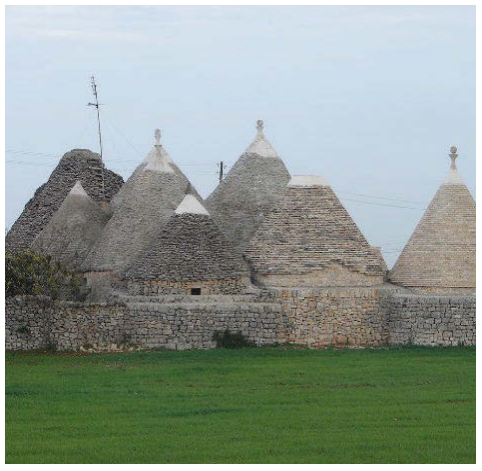
Fig. 3. comparison between original roofs, dismantled and reconstructed roofs and new roofs

In the territorial context, referring to the so-called trulli of Valle d'Itria. where the environmental/landscape value of these buildings appeared to be quite consolidated, there was an attempt to intervene with greater respect towards the original building. However, where it was necessary to redo the entire covering of the roofs, there was a continuation of the disassembly and reconstruction operations that were not really respectful of the original geometries inherited from the past. These forms, in fact, which we could define as plastic, in order to enhance their geometric irregularity, appear to come from an empirically acquired knowledge with which the problem of the connection of the various extrados surfaces was solved, giving life to a genuine sort of mash of stone slabs.