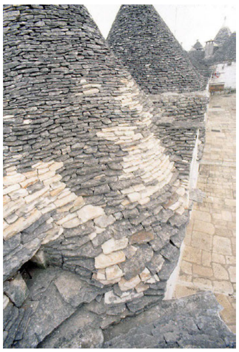
Fig.7. Conservative replacement operation respecting geometric-formal solutions.

Dry stone architecture: the survey as a tool to safeguard the risk of morphological or formal homologation