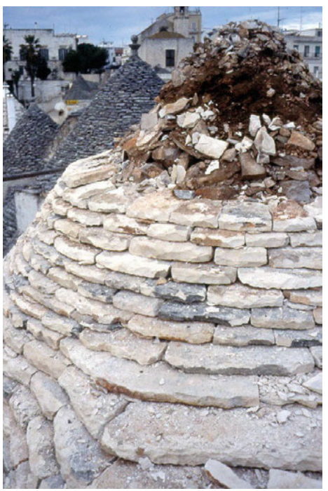
Fig. 8. Bisassembly and reconstruction.

Jiménez de Madariaga, C. (2021), Dry stone constructions - intangible cultural heritage and sustainable environment, Journal of Cultural Heritage Management and Sustainable Development, Vol. 11 No, pp. 614-626.