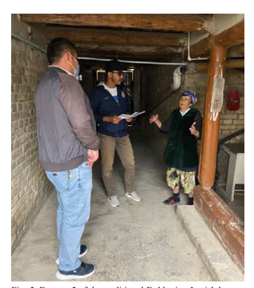
Fig. 5. Feature 5 of the traditional Bukharian Jewish houses: a corridor