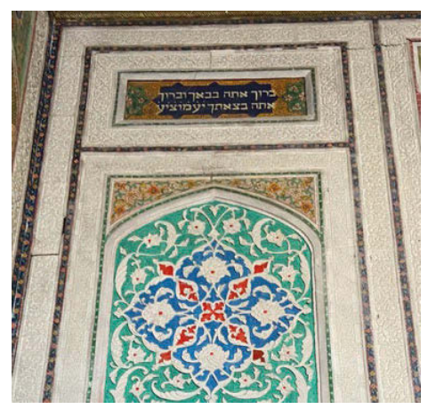
Fig. 3. Feature 3 of the traditional Bukharian Jewish houses: Jewish decoration