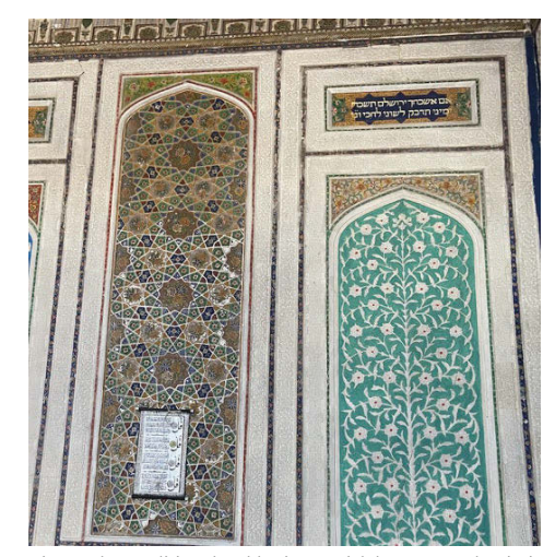
Fig. 7. The Traditional Bukharian Jewish house on Eshoni Pir Street: the Islamic shamail on the left and preserved Hebrew inscriptions on the right..

It is important to highlight that the religious, cultural, and ethnic identity of the current owners of the houses do not always impact the state of conservation of the features. For instance, one of the best-preserved traditional Bukharian Jewish Houses on Eshoni Pir Street is currently owned by a Muslim family, who conserves all original Bukharian Jewish features of their traditional house, including Jewish Decorations and Hebrew inscriptions (see Fig. 7).