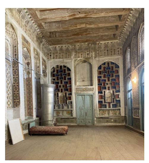
Fig. 2. Feature 2 of the traditional Bukharian Jewish houses: a mekhmonkhana oriented to the west

Feature 2: Mekhmonkhana – guest room. The decoration of the mekhmonkhana was distinguished by some originality, especially in houses