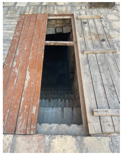
Fig. 6. Feature 6 of the traditional Bukharian Jewish houses: cellars system, a brick staircase connecting the cellars system and the lower courtyard with the upper courtyard

Feature 5: Dolon - corridor. The low narrow entrance from the street led through a covered Lshaped corridor (see Fig. 5) to the cellars system and lower courtyard (rui howli). The L-shaped corridors usually had two doors, including the entrance door and a door, closing the junction of the corridors, creating closed entrance space separated from the cellars system (Yusupova, 2004).