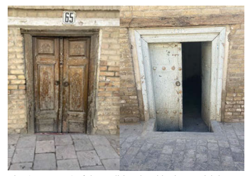
Fig. 4. Feature 4 of the traditional Bukharian Jewish houses: low narrow entrance door (IICAS, 2022)