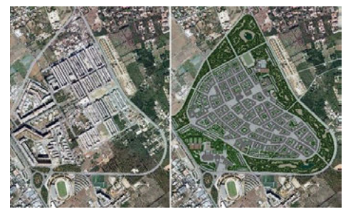
Fig. 6. Project for the Z.E.N. - Before and after.

The projects developed for the Urban Regeneration of the social housing districts Corviale in Rome and Z.E.N. in Palermo, are not about the umpteenth hypothetical theory of reinventing the wheel. Indeed, they simply want to show what we can do through recovering either the laws, tools or policy of