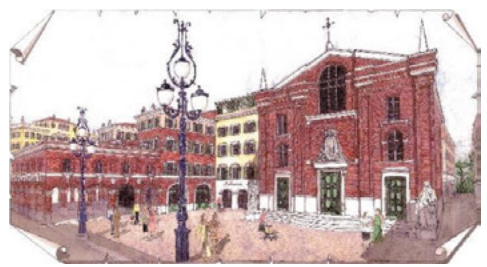
Fig. 12. Project for Corviale - View of the Piazza with the Church and the Market Loggia.