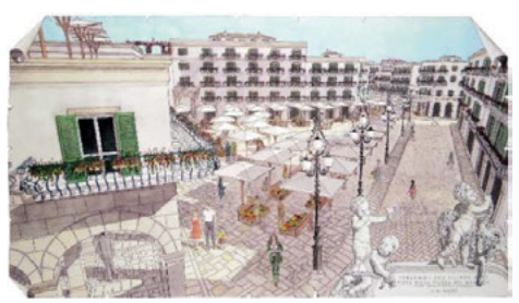
Fig. 17. Project for the Z.E.N. - Aerial view of the Piazza of the Market.

The business plans developed for the regeneration projects for the Corviale and Zen show how, through the simple reuse of the above-mentioned earliest 20th Century solutions, (social, technical and economic), it will be possible to regenerate these neglected places. Moreover, it will be possible to bring back land countryside, to create self-sufficient to settlements provided of all the needed life functions and finally, to have public profits, instead of increasing public debt. In both cases, the business plan shows a revenue of hundreds millions of Euros, which can be reinvested to improve other sad, dangerous and forgotten suburban districts.