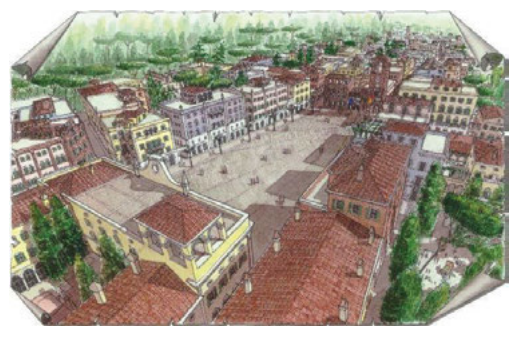
Fig. 7. Project for Corviale - Aerial view of the central Piazza, from the Elementary School to the Town Hall.