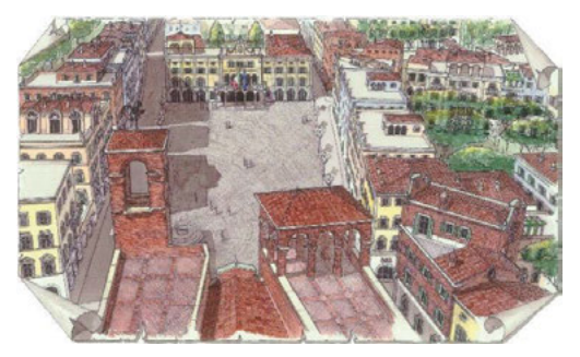
Fig. 8. Project for Corviale - Aerial view of the central Piazza, from the Town Hall to the Elementary School.

The Manuals provide information on all parts of the building, from the walls to the vaults, from the stairs to the floors and the roof, as well as nonstructural details that are fundamental for the consistency of the buildings and for defining their character, e. g. typical doors, windows, floorings, ironwork, railings, chimney pots, water drainage systems. Practically speaking, according to a historical design and nature-loving approach, the Manuals, and all the old treatises can provide a linguistic abacus for a modern architecture ensuring seamless continuity with the past; a modern architecture that is also a school for training local artisans, who are necessary for restoration work.