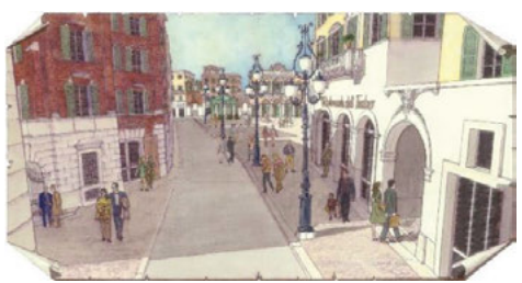
Fig. 14. Project for Corviale - View of the Piazza of the Movie-Theater.