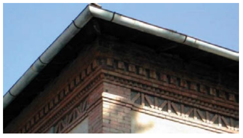
Fig. 2. District San Saba in Rome - brick detail of cornice of one of first 44 houses built between October 1908 and April 1909.