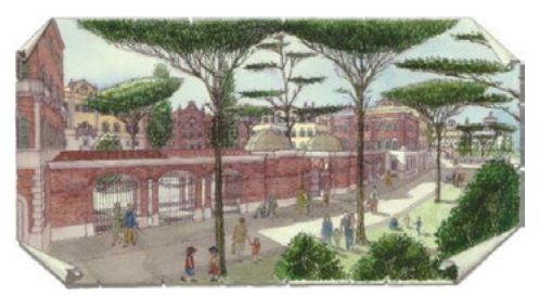
Fig. 13. Project for Corviale - View of the lot XX adjacent to the Public Park.