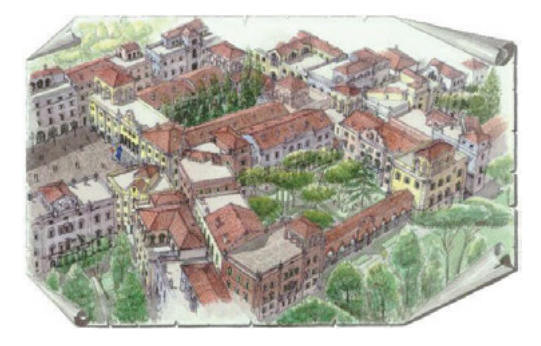
Fig. 9. Project for Corviale - Aerial view of the lot XII adjacent to the Elementary School.