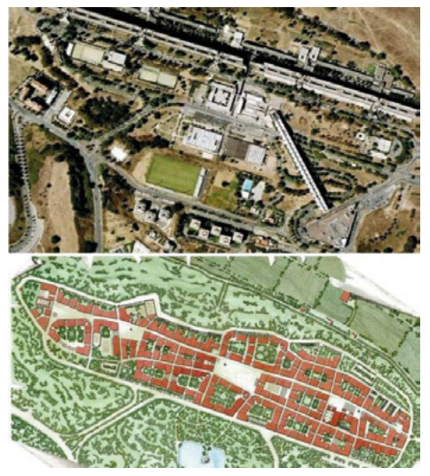
Fig. 5. Project for Corviale - Before and after.