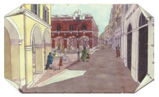
Fig. 11. Project for Corviale - View of the Market Loggia