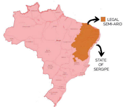
Fig. 1. Location of the Brazilian semiarid region and the state of Sergipe (Map prepared by the author, 2021).

Due to the limitations related to Covid-19 pandemic, it was necessary to perform a digital survey, in order to have an overview on buildings found in the study area and better direct field research. This survey was carried out using Google Street View (GSV) software , which consists of a virtual representation that allows for user to travel, as if in a vehicle, through available routes. Another software used was Street View Download 360 Pro which uses the API provided by Google to enable the acquisition of panoramic images available in a given region, ensuring files with higher resolution quality.