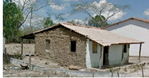
Fig. 4. Example of a wattle-and-daub dwelling in Gararu, Sergipe, Brazil.

In total, 1,394.52 km were covered and 1,810 dwellings (Fig. 4) were marked in the categories reported above. After this survey, it was possible to show data in an overview table (Table 1) and, through that, understanding which municipalities of the legal semi-arid have a large number of buildings in wattle-and-daub, possible to identify under visual analysis.