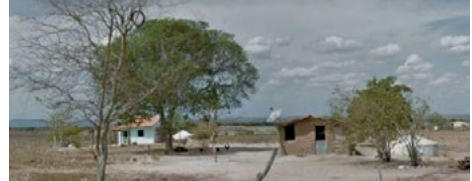
Fig. 2. Example of a wattle-and-daub dwelling in Porto da Folha, Sergipe, Brazil.

In municipalities of Sergipe's legal semiarid region, there are GSV images captured in the years of 2012, 2015, 2018, and 2019, being all of those used in this study.