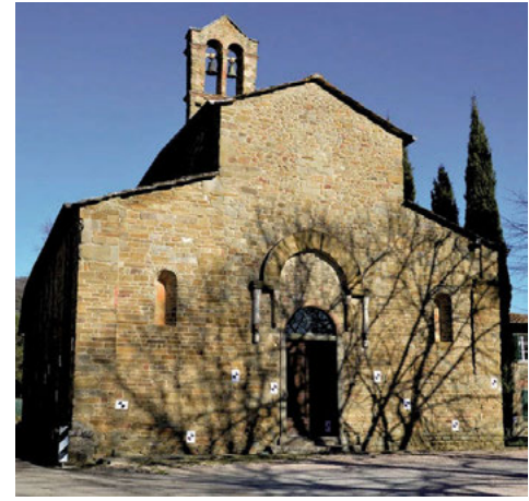
Fig. 2. In Morelli E. (2007). Strade e paesaggi della Toscana, il passaggio della strada, la strada come passaggio, Alinea Editrice, Firenze, p. 59.

influenced the architect not only in the construction of the Duomo Vecchio di Arezzo but also in his later works.