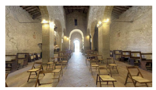
Fig 5. Interior view of the church.

parish church in Metelliano, however, the pilasters are also worthy of note for their display of heterogeneous ashlars. This characteristic is the result of the reuse of remains from the pre-existing Roman temple of Bacchus. What is more, the reuse of material is not limited to the apses: the whole building presents elements re-claimed from Roman structures, mainly travertine (also reworked, like in the façade), and various bricks from the imperial age bearing diagonal incisions (Fatucchi, 1977).