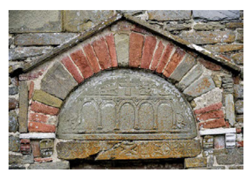
Fig 7. Lunette of one of the side doors of the parish church.

The building, unlike a great number of parishes found in Tuscany, stands apart from the rest for characteristics that are difficult to find elsewhere. The blending of essential elements of Byzantine architecture, first and foremost, the alternated pillars and columns, and the constructive elements of the local tradition makes the building an important example of vernacular architecture.