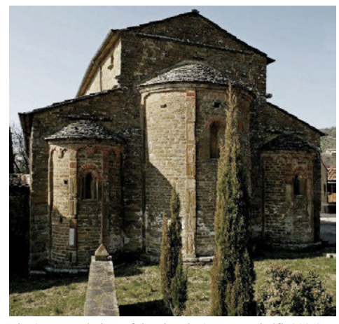
Fig 6. External view of the church.