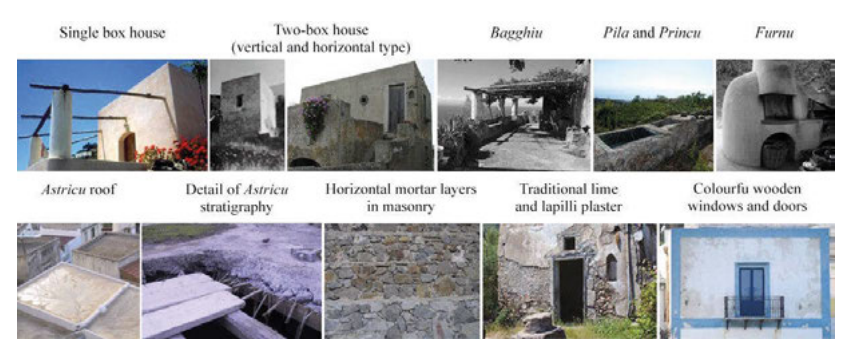
Fig. 2. Elements of Aeolian vernacular architectures

Over time, several factors have influenced and modified the building process. This has led to a progressive technological transformation extraneous to the local culture, which will be discussed in the following paragraph.