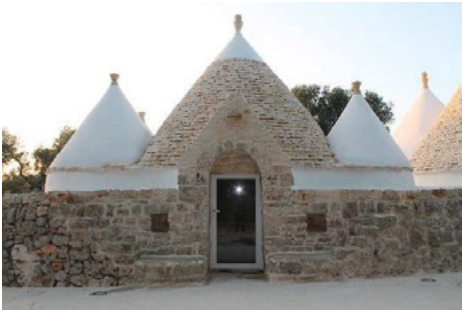
Fig. 9. An example of sustainable intervention.