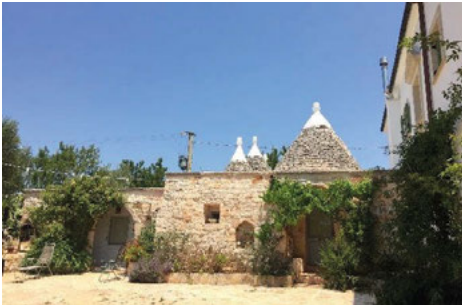
Fig. 10. An example of sustainable intervention (Source: Farina, 2018).