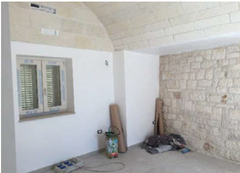
Fig. 11. An examples of incompatible intervention.