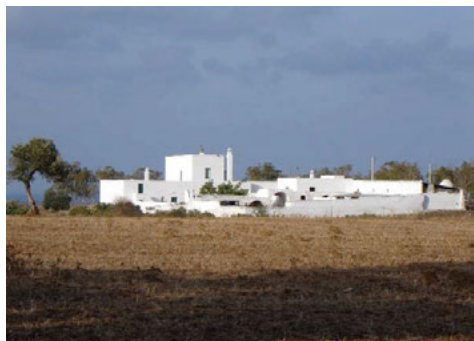
Fig. 6. Masseria Fontenuova (Source: Farina, 2021).

1800. It consists of various extensions of privately owned land and related buildings, which combine residential and productive needs and are managed completely independently. The layouts of these constructions are usually compact farms, linear closed courtyards, fortified enclosures etc. In general, these take the form of a real rural village, composed of several buildings such as the manor house, the accommodation for servants and farm workers, the out houses, animal shelters, stores and other additional elements.