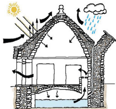
Fig. 7. Bioclimatic characteristics of a trullo (Drawing by the author, 2022).

constructive strategies and systems which exploit the few local resources available to satisfy basic comfort and living needs.