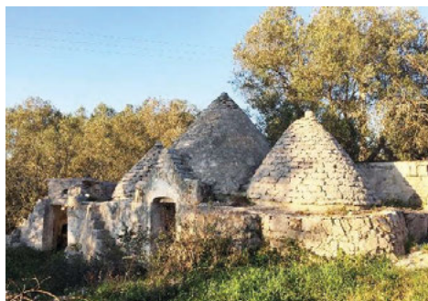
Fig. 2. An abandoned trullo (Source: Farina, 2022).

The trullo is characterized by a regular floor plan and conical roof, externally covered by chiancarelle 2 arranged in concentric circles that narrow upwards and closed off by a disk-shaped stone supporting a decorative pinnacle. Thanks to this roofing method rainwater is collected and then transported to an underground cistern. This system provides not only a precious supply of rainwater but also a resource for cooling the air around the water and lowering indoor temperatures during the summer.