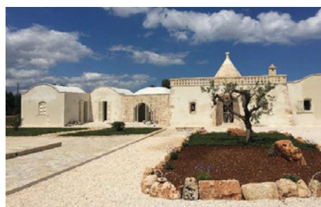
Fig. 8. An example of sustainable intervention.

A recognizable and predominant feature is that of the thick external masonry which protects from extreme external climatic conditions (harsh winters and long hot summers), combined with few small openings (doors and windows). In fact, this system exponentially increases the thermal inertia of buildings and implements a thermal shift between night and day, giving rise to real heat exchanges. The mixture of lime, red earth and clay used to seal the ashlar (stone masonry) helps to delay the entry of the thermal flux of solar radiation and to insulate and protect from heat dispersion during the winter. The external finishes are also of importance: the typical white lime-wash reflects the solar radiation, thus avoiding heat accumulation. The collection and reuse of rainwater, stored in underground cisterns waterproofed with hydraulic lime, is an example of sustainable water management.