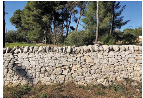
Fig. 5. Detail of a dry stone wall (Source: Farina, 2021).

The complex systems consist of freestanding buildings like farms and auxiliary elements such as farmyards, barns, cisterns, kilns, dry stone walls or millstones.