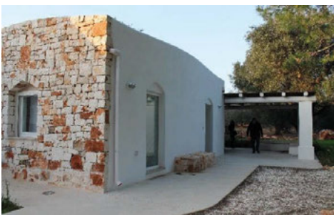
Fig. 12. An examples of incompatible intervention.