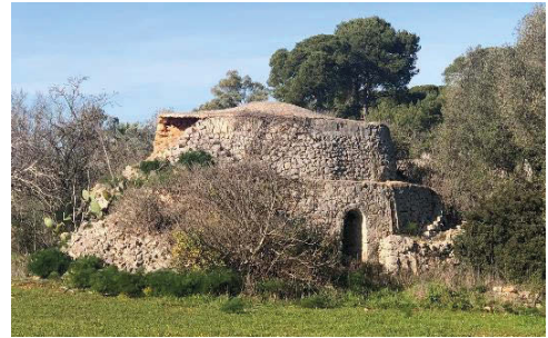
Fig. 4. A typical casedda.

characterized by three overlapping components. The first, the base, is the same height as the entrance door; the second is a truncated ellipsoid with a perimeter smaller than the base, while the third resembles a dome or semisphere. The masonry, built of small stones, is plastered and whitewashed and the roof is flat and semispherical. The limewashed surface finish is also a frequent feature of these buildings. These were regularly limewashed both for the purposes of hygiene and aesthetics.