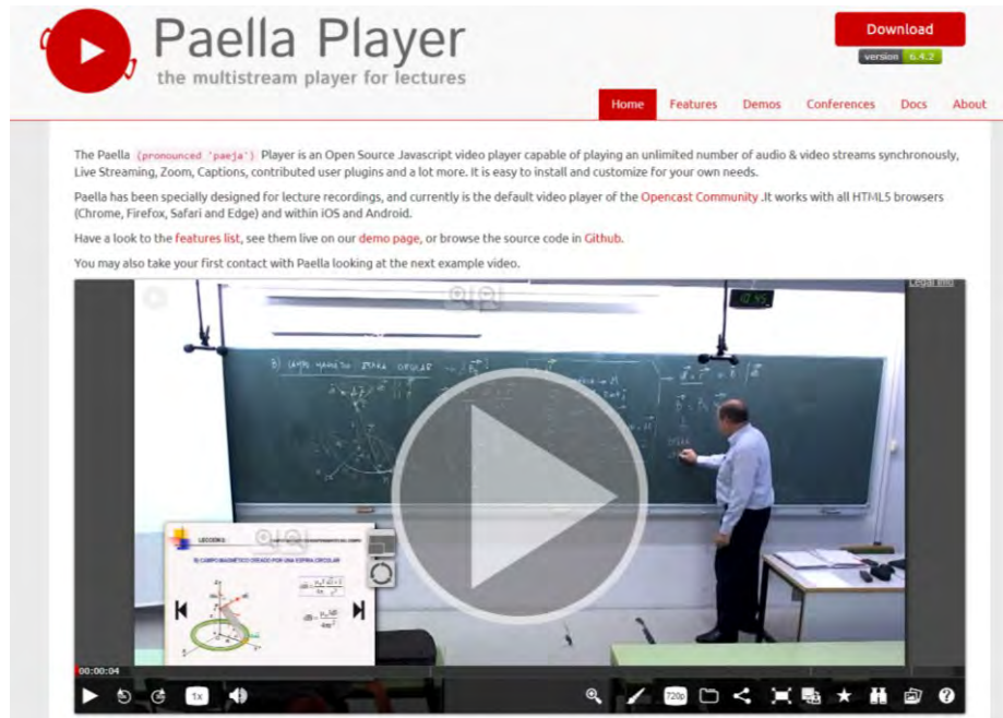
Fig. 2. Application of video notes