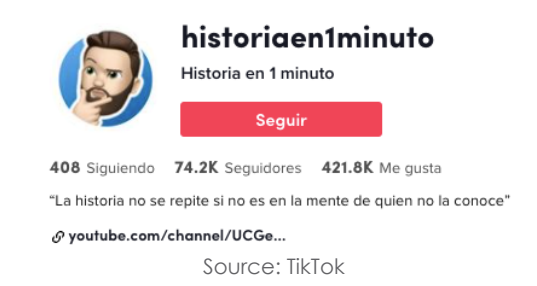
Figure 6. TikTok bio of the profile @historiaen1minuto

Recognition of these efforts is important because although the social media platform's algorithm encourages interest and engagement among the community of users when a video is posted, in a context with an increasing number of creators vying for audience attention with more captivating content, it is commendable that users like these are addressing these topics and even promoting hashtags such as #edutok and #aprendeentiktok (literally, 'learn on TikTok'), effectively reducing the potential impact of speculative content and disinformation on the platform.