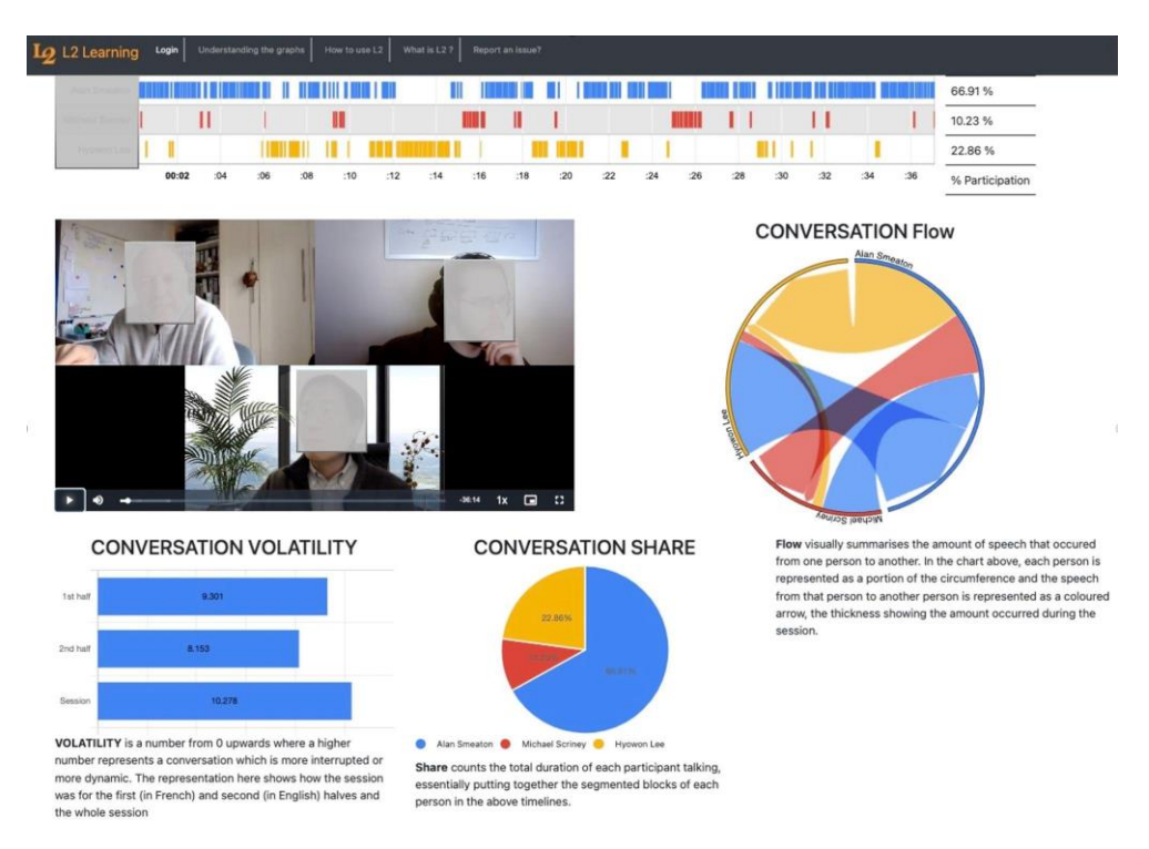
Figure 1: Screengrab from L2 Learning System

call conversation volatility, described in the next section, is also shown for the overall and for each half of the meeting as a bar chart on the bottom left. The conversation flow chord graph is useful to illustrate when a subset of participants dominate the Zoom call by having their own conversations among themselves and 1 or more of the remainder are left out of the dialogue. This can happen for any of several reasons, including when a participant is not comfortable speaking the language of the conversation at that point in the Zoom call. The colour coded utterances on the timeline are hotlinked so clicking on any of them starts video playback shown in the middle of the screen with the headshots as a gallery view of the 3 participants in this case (with faces blurred).