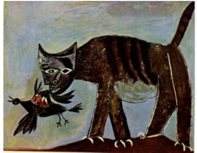
Figure 4- The cat is eating the bird (Pablo Picasso, Cat Catching a Bird, Oil on Canvas, 1939)

There is also an anarchist spirit in Mohasses’s works; This mental trait is so descriptive that he surprised everyone, even in words, and suddenly attacked the audience with a few words that knocked the roof over his head. Some analysts believe that Mohasses never looked down from a position. Even if he mentions in his words that I look from above, this angle of view does not mean arrogance. There is no doubt