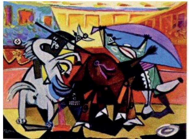
Figure 5- Bullfight (Pablo Picasso, Course de Taureaux, Oil on Canvas, 1934)

that Bahman was far superior to his peers. He was not short of accepting, accepting or coping. Enough of his sharp behavior, that even in the presence of the Queen, he did not stop smoking and can be said to have a unique behavior (2016 Baghestani,).