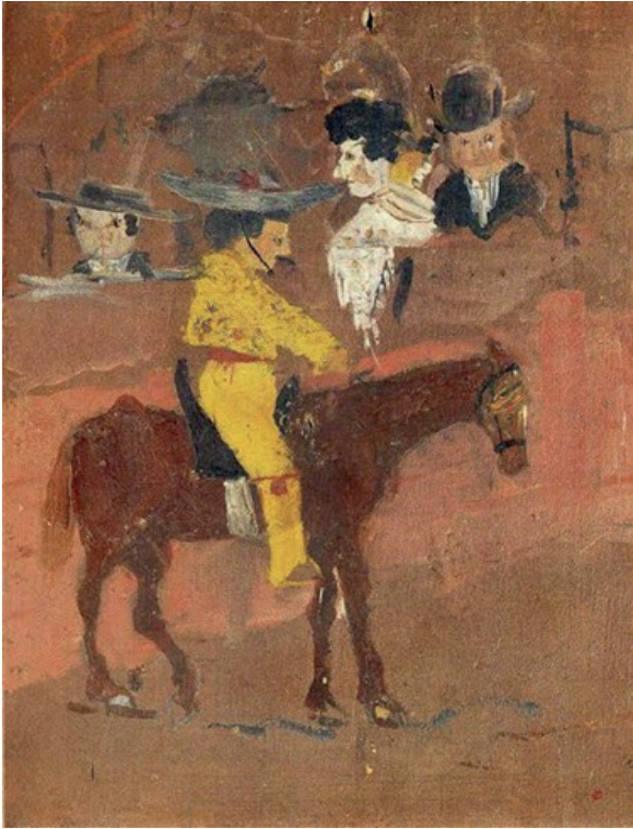
Figure 2- A man on horseback at a bullring (Pablo Picasso, Le petit Picador Jaune, Oil Paint on Wood, 1889)