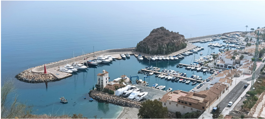
Figure 2. General view of Marina del Este with Peñón de las Caballas as a structuring element.

years. This award recognizes the environmental quality in marinas that make a special effort in terms of local environmental management and nature. Obtaining the Blue Flag implies that the marina must meet various requirements related to environmental education and information, environmental management, services, safety, and water quality. All this provides the visitor with a reliable guarantee regarding the environmental quality of the marina [45].