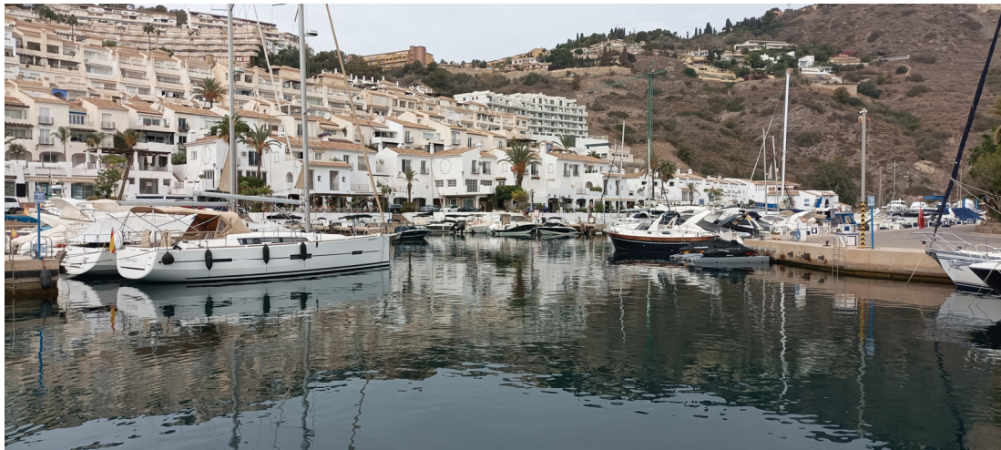
Figure 5. View from the port, with urbanization in the background (photograph by authors, October 2022).

Between the lowest values were social ones (“Meeting point”, “Catering”, “Complementary activities”, “Leisure”, or “Shopping”), as well as “Tradition” and “Fishing”. On the one hand, the results of the interviewees are consistent with the outcomes of the interviews. The lack of commercial development appreciated in the SWOT analysis justifies the low valuation of social aspects. On the other hand, tradition requires a sustained activity over an extended period, avoiding the marina being reduced to mere craft-berthing, adopting monotonous and anodyne solutions, and lacking links to their environment [1]. Finally, fishing is decreasing as restrictions have been increased in nearby protected natural areas.