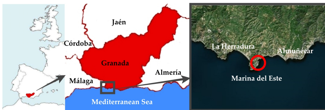
Figure 1. Location of Marina del Este.

We considered Marina del Este, found on the Southern Spanish Mediterranean coast as case study. Specifically, it is located in the town of La Herradura, belonging to the municipality of Almuñecar (Granada). It is the last town on the coast of Granada before entering Malaga (Figure 1).