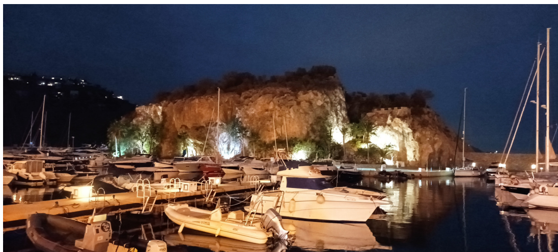
Figure 4. View of the Peñón de las Caballas (photograph by authors, October 2022).

Finally, the resume question in this survey was included to assess the importance of landscape within the marina. The response was affirmative in a high percentage.