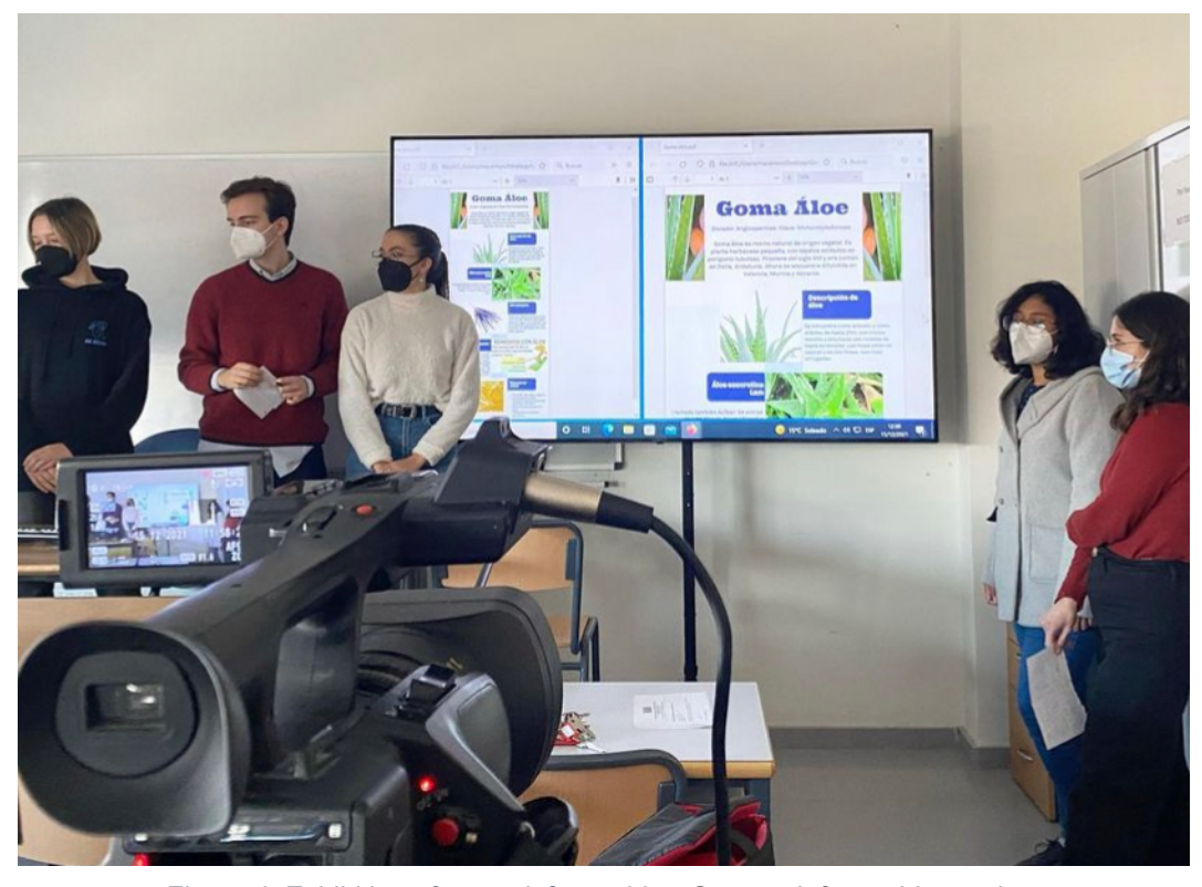
Figure 4. Exhibition of group infographics.

The evaluation was carried out by rubric, for the infographic works and observation for the presentations and debate, paying special attention to the interaction between the students.