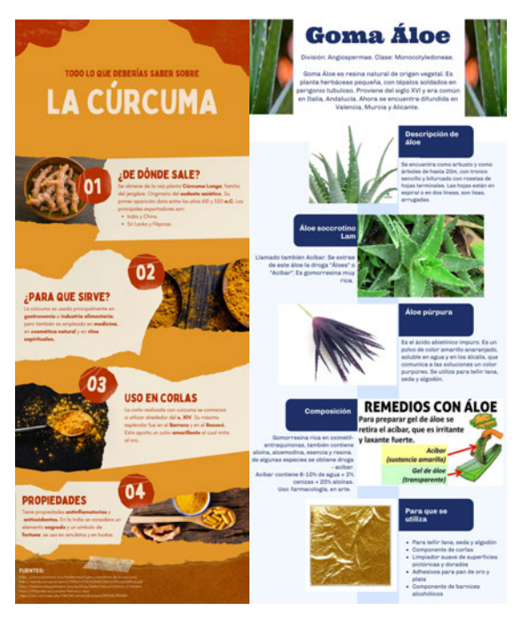
Figures 5,6. Examples of group infographics.

The students value that the applications are intuitive, easy to understand, that they guide you during the process, that the designs are adaptable, that you can work online with several devices at the same time, that the interface is comfortable and that it does not involve any economic cost.