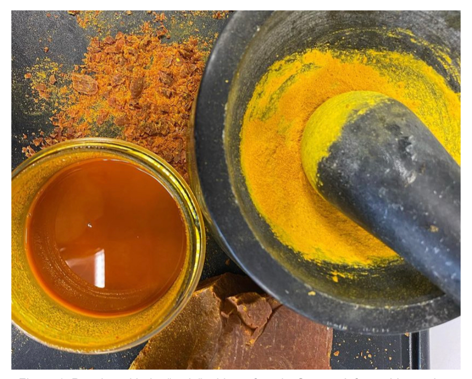
Figure 1. Practice with the "corla", object of study.

In our case, an activity related to the "corlas" was proposed. "Corlas" are stains of various shades that are applied to silver to give it the appearance of gold, or to give it a specific shade, without removing the shine from the surface [4]. The materials on which they had to carry out the research were resins and dyes of natural origin. At the same time, we carried out practices with the resins in class so that they could understand their composition and color, as well as hardness and solubility, so that they could identify the different materials (FIG.1).