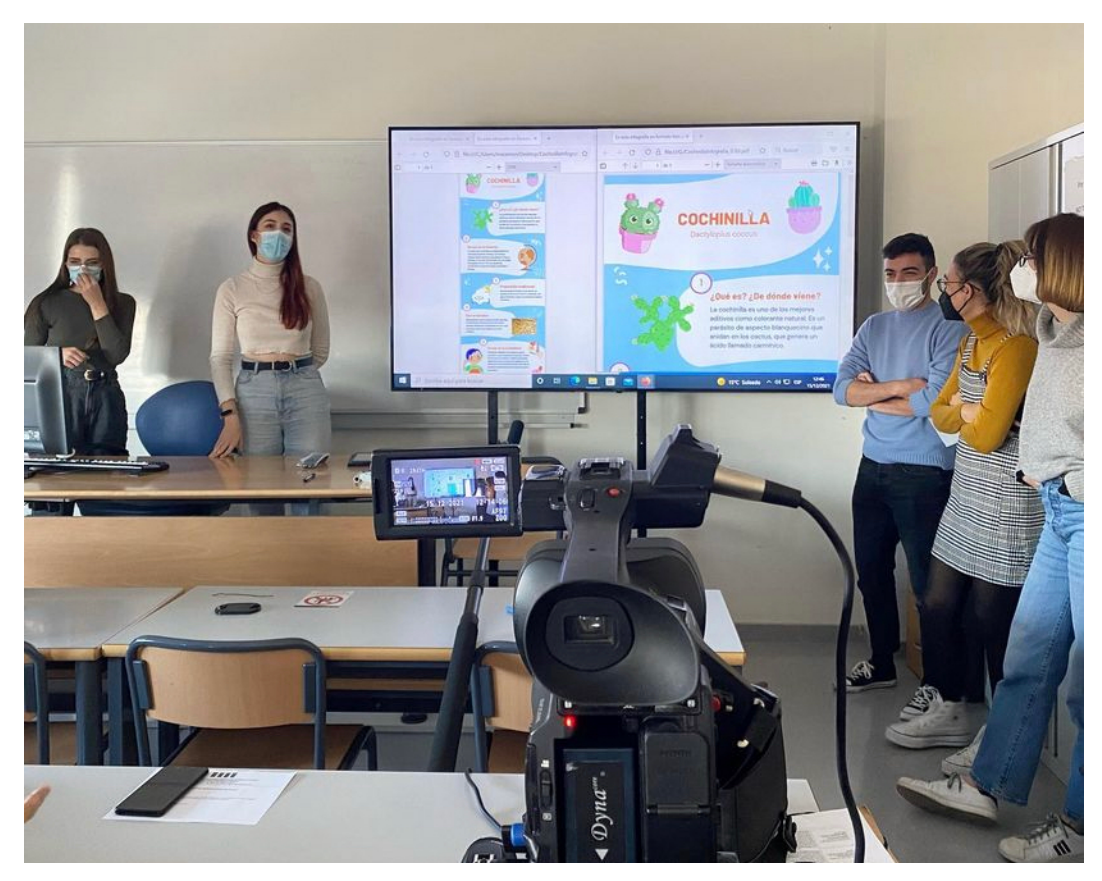
Figure 3. Exhibition of group infographics.