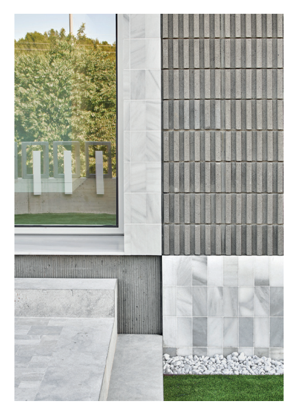
ARQUIA'S MAIN OFFICE IN PALMA