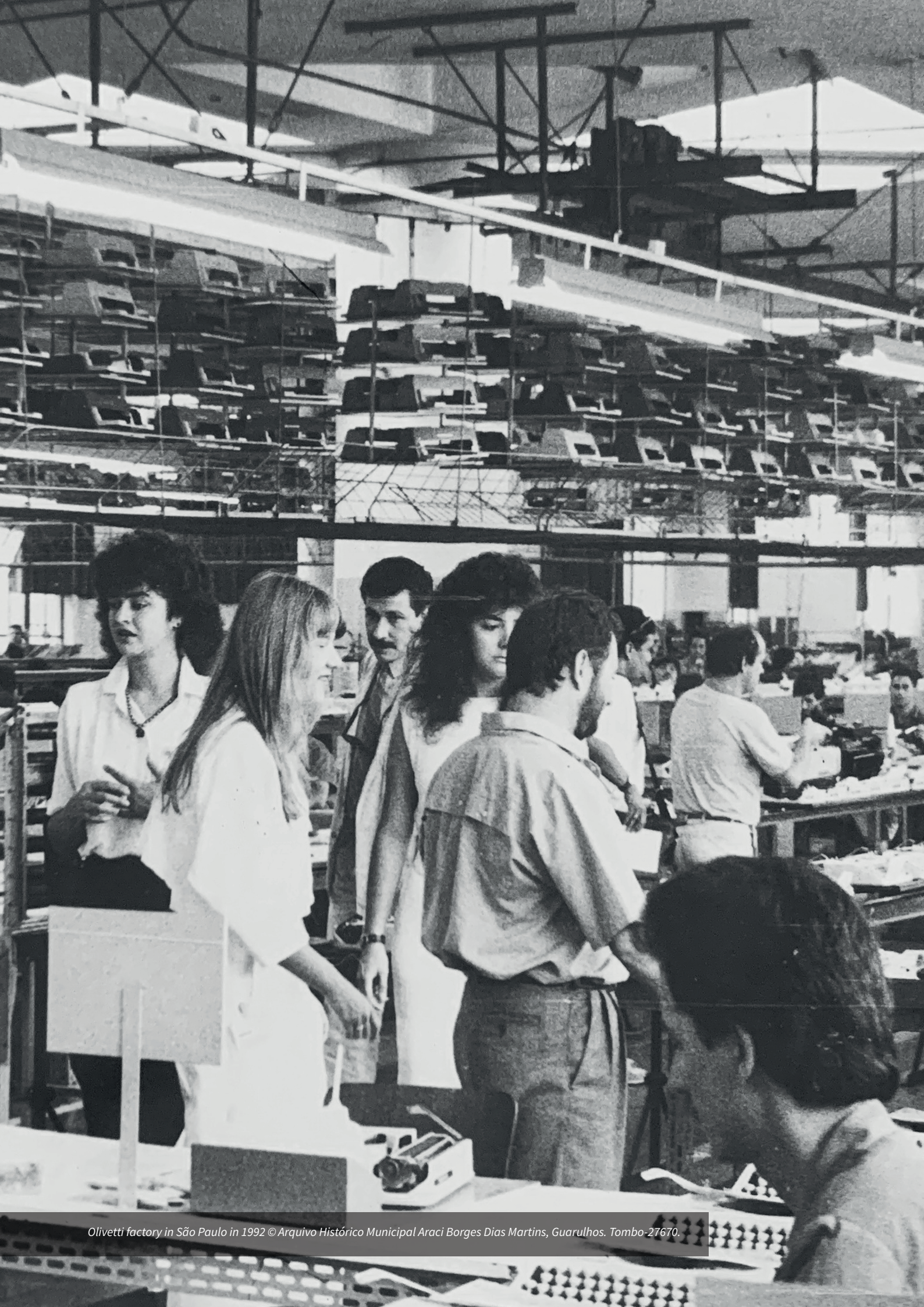
Olivetti factory in São Paulo in 1992