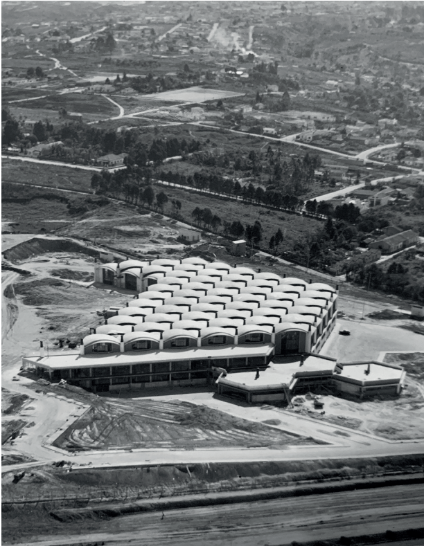
Figure 1 | Olivetti factory under construction. São Paulo, aerial photograph, 1959 - © Masami Kishi, Arquivo Histórico Municipal Araci Borges Dias Martins, Guarulhos. Tombo-3009.