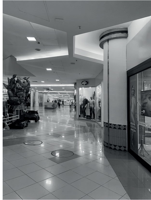
Figure 7 | International Shopping Center Guarulhos interior view of the part that was originally dedicated to the assembling area - © Giuliana Di Mari, 2022.

rather than technocracy. Zanuso found such a concept in Adriano Olivetti's production philosophy to a certain extent. Zanuso's factories for Olivetti were explorations of industrialised architecture. Through their reflection on the approach to architecture, and industrial design, these factories were distinctive investigations into the relationship between architecture and industrial design.