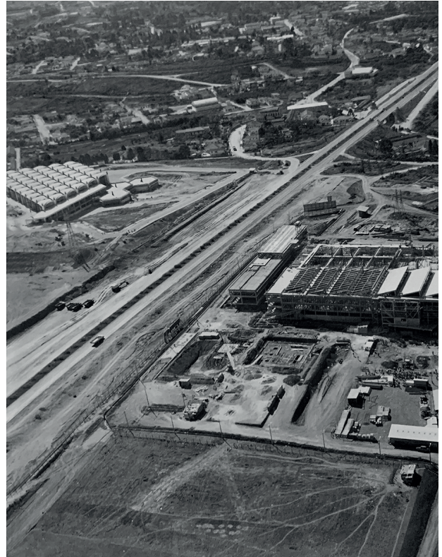
Figure 2 | Olivetti factory on the left and Philips factory on the right under construction. São Paulo, aerial photograph, 1959 - © Masami Kishi, Arquivo Histórico Municipal Araci Borges Dias Martins, Guarulhos. Tombo-3010.

him the “ topos of the contemporary technical environment” (Porta, 1982: 636), which leads him to approach Olivetti’s vision of the industry, so full of anthropological underlining of the workplace, grasping all its functional, productive, technological and sociological complexity.