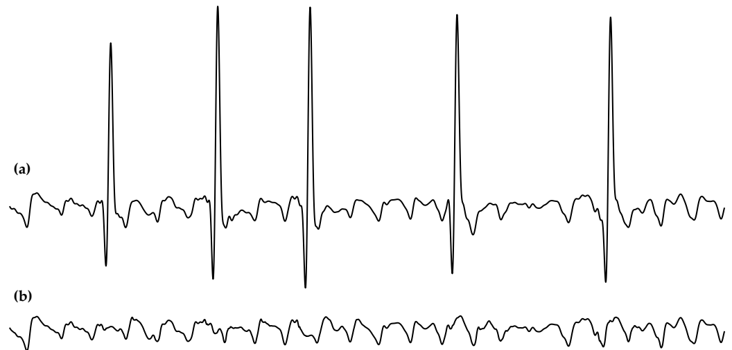
Figure 1. Example of a common (a) preprocessed ECG interval and (b) its f -waves extracted via a well-known QRST cancellation method [32].

avoids spikes caused by discontinuities between QRST complexes and the subsequent TQ intervals through a softening approach that considers the differences between the cancellation template and the QRST segment at its beginning and end to minimize sudden transitions [32]. As an example, Figure 1 shows the f -waves obtained from a typical preprocessed ECG interval.