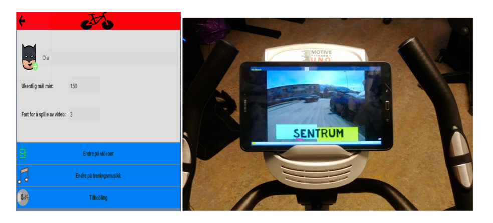
Figure 3. Screenshot of the app main menu (in Norwegian) and an example of a ride in the city center.

The app allows the user to customize a profile and track the sessions he or she performs (duration, intensity, goals, achievements, etc.). The main menu of the application shows navigation menus with which the user can select the type of routine and the entertainment modality (ride in the city, ride in the countryside, music, TV show, or a movie). A Unity application is usually organized into scenes, each of which stands as a container for an environment that has common properties. Several scenes are usually used to separate different levels in a game, where each level differs significantly in visual content and functionality. In the implementation of the exergame, a unique scene is used with several components that build up the functionality of the app. The core of the app consists of handlers managing the state of the game and panels displaying the app content.