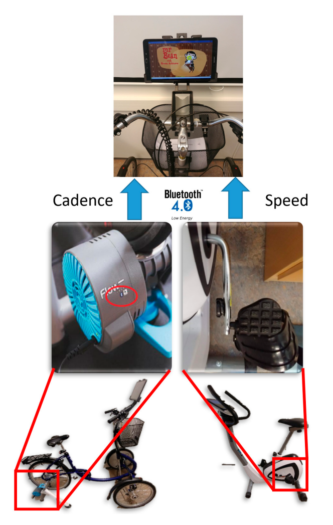
Figure 2. Exergame system based on static bicycle.

The app was design for use with a touchscreen or a tablet. When designing for a touchscreen, all navigation and action that requires user input must be accessible through the display view, and all interactive elements must be easily identifiable the target users of the exergame (Figure 3). The virtual environment of the exergame is controlled by a main application developed in Visual Studio. The application tracks the navigation, changes in the settings, and data storage, manages Bluetooth communications, and maintains the application life cycle.