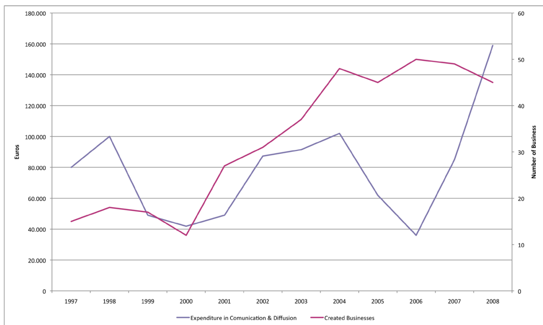
Figure 3: Evolution in the Expenditure in Communication & Diffusion Activities versus Number of Created Business

When we analyse the data of Figure 3 we must note that the expenditure in this sort of activities will affect in the next period of time to that committed. This way we can link the abrupt decrease in the expenditure during 1999 and 2006 with the respective decrease in the number of business firms created in 2000 and 2007-2008. Coming back to the analysis based on strategy changes, between 1997 and 2000 we observe that increases in entrepreneurs' support activities expenditure match with decreases in communication and diffusion activities expenditure.