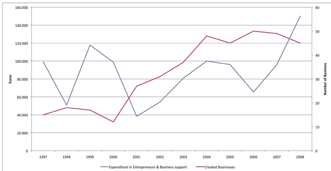
Figure 2: Evolution in the Expenditure in Entrepreneurs & Business support versus Number of Created Business

Figure 2 clearly shows the portrayed differences among the three periods of time matching with the direction changes. Between 1997 and 2000, the expenditures are erratic reflecting the lack of a clear strategy while the number of business firms created is constant showing a smooth decrease. From 2001 to 2005, these two data series grow in parallel: the strategic change in the IDEAS Programme also supported by the UPV begins to offer positive results in terms of number of business firms created. This strategy is also accompanied by an increase in the number of activities carried out at IDEAS Programme and the respective expenditure. During the last period of time (from 2005 on) we observe an increase in the number of entrepreneurs' support activities but the number of business firms created decreases. The strategic changes in this last period of time involve, on the one hand an increase in human resources devoted to the new activities (Table 1), emphasizing those addressed to specific advice for technology-based spin-offs creation and their legal framework development. On the other, the