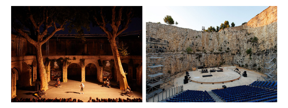
Figure 1. Performance in the Cloister of the Célestins (left) and staging in the Boulbon quarry (right). (Christophe Raynaud de Lage 2018)