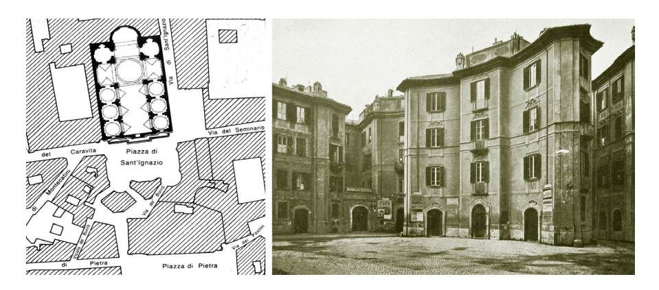
Figure 3. Piazza di Sant'Ignazio. Urban fabric (left) and appearance in the 1930s (right). (Unknown authors 20th century)

The truth is that both the shape and the position of the buildings in Piazza di Sant'Ignazio generate a kind of urban scenography, assuming the role of backdrop in a public space that resembles a theatre scene. In places like this, the conjunction between buildings and open space takes on the appearance of a street stage, where everyday life becomes a live performance. In Spain, other more recent architecture cases that also generate urban scenographies can be found. In the northern zone, some of the squares planned by Luis Peña Ganchegui have this character too, as for example the Plaza de la Trinidad (Donostia, 1963), the Plaza del Tenis (Donostia, 1975) and the Plaza de los Fueros (Vitoria-Gasteiz, 1979). They all generate a scenographic atmosphere due to their forms, in which the staggering is a crucial element. In addition, its link with the surroundings is also an important issue (Sangalli Uggeri 2015). This can be seen especially in the latter (Fig. 4), where the relationship with the sea and Chillida's sculptures is highly relevant. In such a context, human activity is theatricalised. The routine is framed in a space that expresses a message of its own.