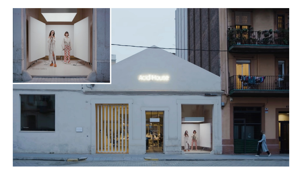
Figure 5. Performance by Rigoberta Bandini at Window Gallery in the Acid House Innovation Centre. (Gallery Session 2021)

As explained, the theatre has been connected to the urban space configuration throughout history. Although this relationship has traditionally been associated with the construction of buildings and structures for theatrical performance, nowadays, this link has an entirely different meaning. The relationship between the theatre and the city is no longer determined by its imprint on the urban fabric exclusively. The transformative power of theatre today lies in activities such as street performances, and the festivals analysed here are proof of this. Although Avignon, Bilbao and Tàrrega are very different cities, the touring theatre fulfils the same function: to participate in urban regeneration and the evolution of public space. Whether a square, a religious temple, a garden or even a guarry, the performing arts can revitalise and re-signify the space in every place. Art and culture can adapt to every context and