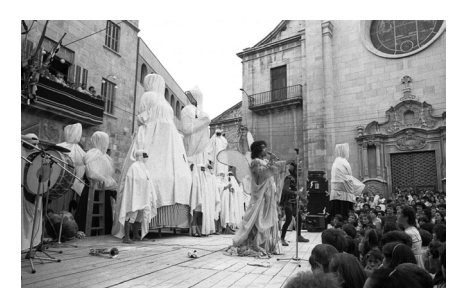
Figure 2. Comedians in the Main Square of Tàrrega. (Pau Barceló 1981)

Touring theatre makes its way throughout the town, occupying representative spaces such as the Main Square, the church, the schools, the local theatre, etcetera (Què és FiraTàrrega 2022). The former is the most emblematic place in the city's historic centre. A series of buildings of significant heritage value converge here: the Town Hall (17th century), the Church of Santa Maria de l'Alba (17th-18th centuries) and the Chamber of Commerce and Industry (19th century). As for the religious temple, it is a listed building in the category of historical monuments. Its baroque style with some neoclassical features and its facade become one of the backdrops for live performances year after year. Pictures from different editions of the fair show the main stage built in front of the Town Hall. For this reason, its front wall is in the background, while the church remains on the right (Fig. 2). The audience takes up the venue standing together in front of this removable stage.