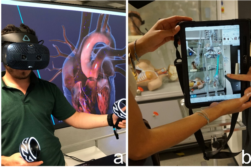
Figure 1 a) Student while studying cardiac anatomy and physiology using a virtual reality headset. 0000b) Students using an AR software on a tablet to virtually dissect a skeleton while plastic 0000000models like the one in the display case in the background are used for comparison.