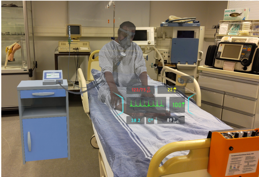
Figure 2 Displaying the progression of a virtual Covid-19 infection on a patient simulated to be in a real-life training replica of an intensive care unit with real medical equipment, using AR glasses.