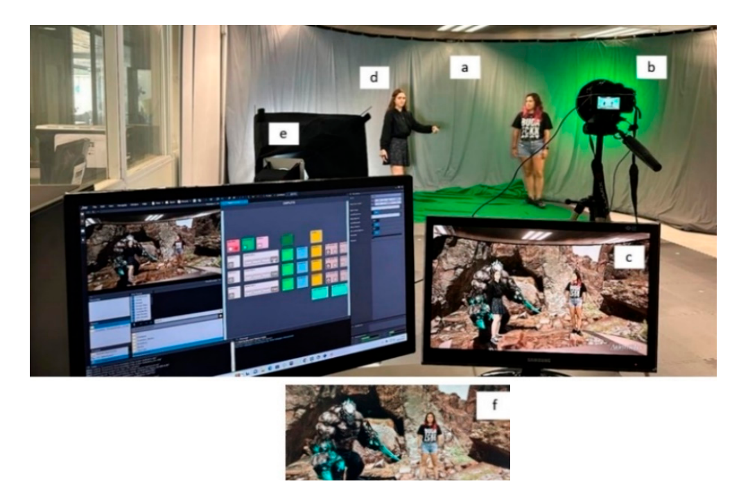
Figure 3. Chroma Virtual Production Set tested at the lab. (a) Chroma Backdrop; (b) Camera with tracking system; (c) Reference Monitor; (d) Talent with PCap system; (e) Lights; (f) Realtime Compositing.

The establishment of an indie virtual production set, illustrated in Figure 3, serves as a multifaceted platform catering to both film production and educational purposes. By incorporating real-time rendering game engines like Unreal Engine, filmmakers are afforded the opportunity to immerse themselves in virtual environments, marking a transformative shift in content creation methodologies. This shift is characterized by a move towards a parallel and collaborative pipeline, a significant departure from the traditional sequential task completion process, signaling VPX's burgeoning influence globally due to the ongoing advancements and increasing accessibility of virtual production technologies.