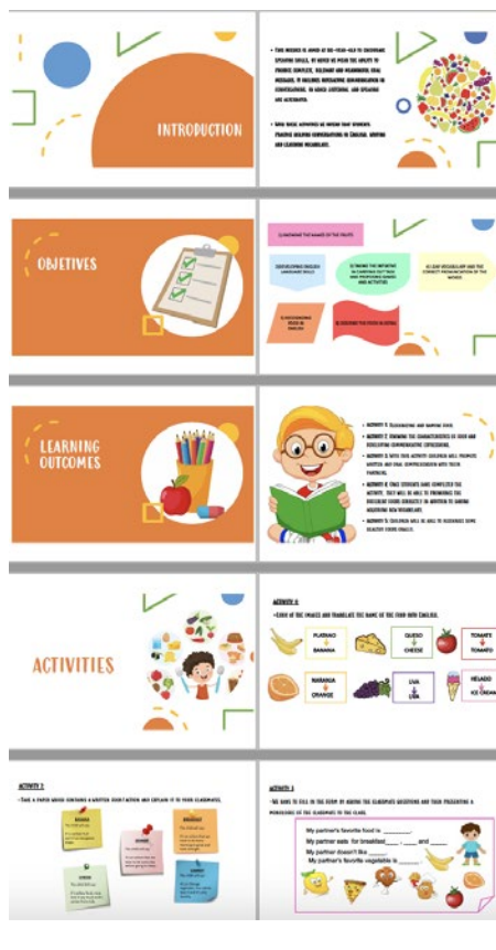
Figure 2. Portfolio sample.

The lecturers then allowed the diverse students to vote on the topic deemed fit for them to be discussed in the next session. This gave the students a wider variety of the topics available, and a majority voted topic was selected. The participants met once every week for five weeks, each session lasting 45 minutes. The time frame allowed maximum concentration on the topics discussed since too much time may be boring as they will start showing signs of disinterest. However, the students were not restricted within the 45 minutes meet and could participate in any other discussions. Likewise, the one-week time frame between one session and the other allowed students who may not be well conversant with the topic to grasp what it entailed and thus feel included in the conversation. The learners conducted their weekly meetings via the Zoom platform to facilitate communication within borders due to the Covid 19 restrictions on physical interactions. Zoom is more efficient and effective as it allows video calls, sharing screens, and exchanging messages without barriers and interruptions. However, in an attempt to effectively communicate via the Zoom platform, not all the students dedicated their work to the project, and minor issues of time lateness were noticed. This investigation showed the students' positive attitude regarding the portfolio curriculum approach, as commented during the final discussion (see Figure 2).