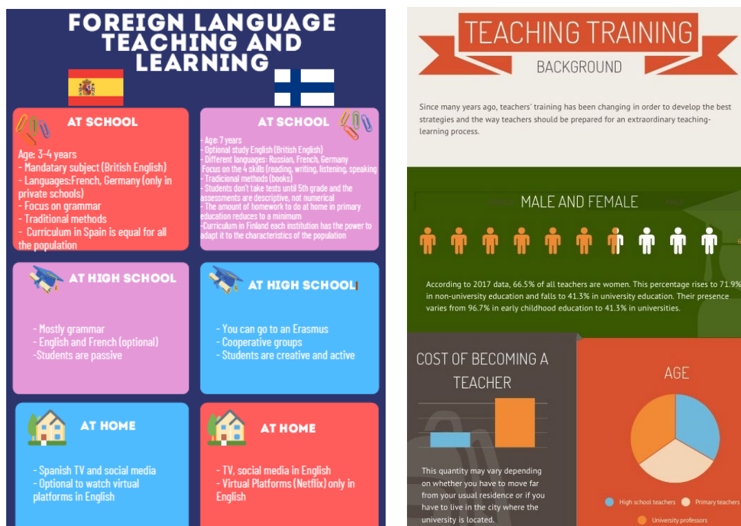
Figure 5. Posters designed by students.