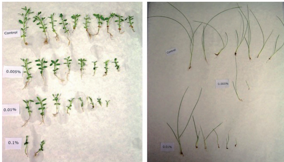
Fig. 3 Seedling emergence and development of Ononis ramosissima and Ammophila arenaria seeds previously incubated in solutions of different doses of glyphosate.

2000; Piotrowicz-Cieślak et al. 2010) Fabaceae (Piotrowicz-Cieślak et al. 2010; Gomes et al. 2017; Mondal et al. 2017) and Brassicaceae (Piotrowicz-Cieślak et al. 2010; Kashyap et al. 2023). As expected, based on the widespread use of glyphosate for pre- and post-emergence control, the presence of this herbicide in the incubation medium inhibited seed germination of all the dune plants used in this study (Fig. 1). In addition, the percentage inhibition of germination by glyphosate was clearly associated with the dose (Fig. 1). The germination was completely inhibited at doses of 0.5 and 1.0 g/m 2 (Fig. 1), which are both above the recommended dose of 0.3 g/m 2 (EFSA 2017). The inhibitory effect of exposure to glyphosate decreased progressively for doses equal to or lower than the recommended dose (Fig. 1).