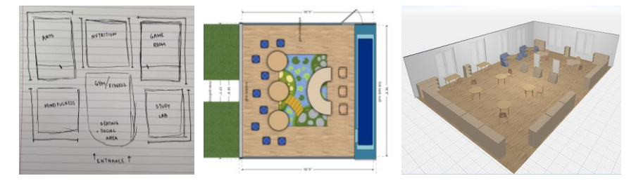
Figure 2. The variety of options for examples selected by students for the initial design stages.

Within the phases of the project, there was an initial stage for brainstorming, idea creation, and planning. This took on a variety of forms with students choosing whether to sketch by hand, utilize floor planning design software, or create more complex drawings through 3D modeling software (see Figure 2). The next phase required moving plans into the software programs that connect to the maker tools. The final phase involved constructing the models (see Figure 3).