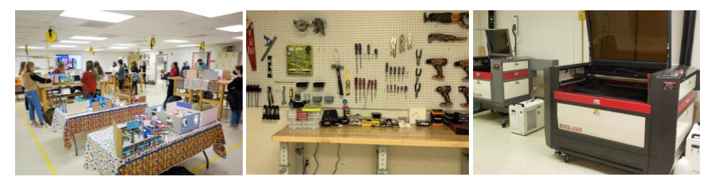
Figure 1. Facilities and tools of the WakerSpace.

The first half of the semester took place in a standard classroom and focused on the more customary topics of a foundational learning psychology course. Classes then moved into the university's makerspace, known as the WakerSpace (see Figure 1), for the second half of the semester. The space has a dedicated staff director and is administered by 25 student volunteers. The revamped course placed a strong emphasis on experiential learning and the design of learning environments. This was achieved by incorporating a significant maker project, fostering an active learning environment that bridged hands-on experience with theoretical concepts.