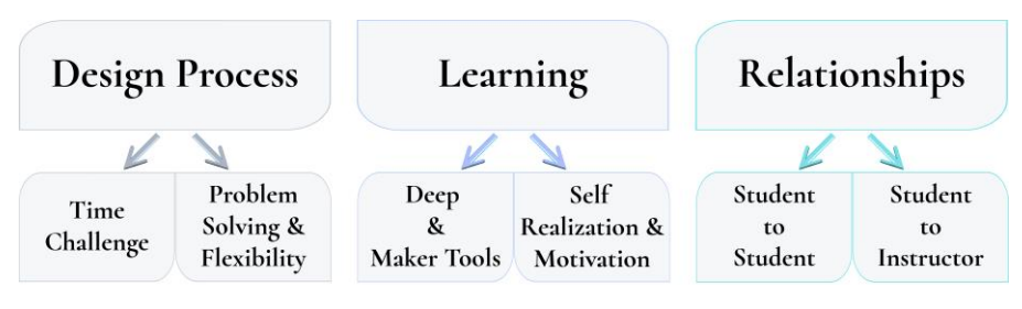
Figure 5. Coding Scheme.