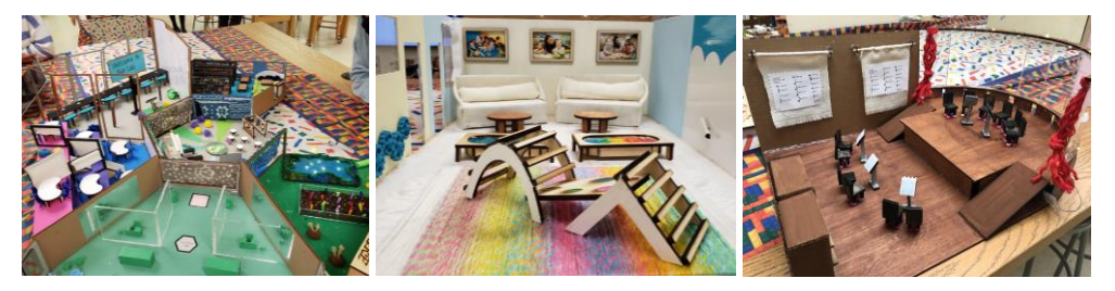
Figure 3. A collection of final learning spaces created by students.

A foundational aspect of the design of the project was the recognition that this was not an engineering course, where students might be expected to master the software and tools for academic and professional environments. With most students coming from the humanities, the design and scoring of the project required an alternative structure. Therefore, the framework for the study was created with the intention of moving beyond simply serving as a grading rubric, instead capturing the genuine process of project creation (see Figure 4). As such, the first stage, Ideas , was intended to allow for students to experiment, take risks, and make mistakes, all foundational aspects of experiential and maker learning. Similarly, Participation can often be an elusive aspect to assess. This was primarily captured by the instructor taking notes throughout all class meetings and the use of weekly reports and surveys for capturing progress and logging of use of time. Support materialized in a variety of ways within this project, with students