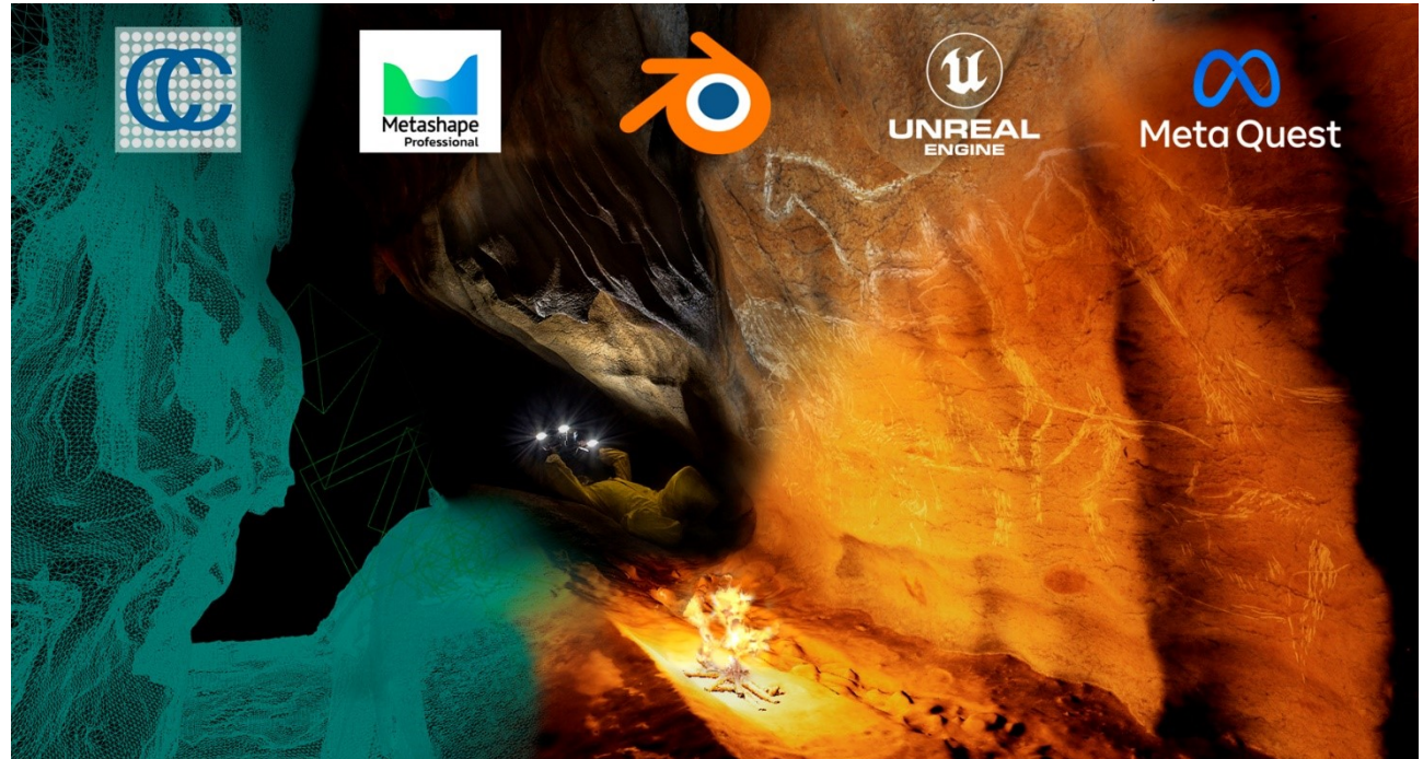
Figure 3: Visual synthesis of the virtualisation workflow. From photogrammetry and laser scanning to virtual restoration and lighting, and integration into the graphics engine.

In this way, archaeological remains such as flint tools used to engrave motifs are closely linked to artistic production. However, other traces, such as charcoal remains, reddened clay, or thermal alterations in the rock, reveal actions that could have been intrinsically related to the artwork, although they may not be as evident at first glance and may be linked to different phases of visitation. This is why all remains found in the site are a potential source of historical information to reconstruct the context of the creation/viewing of Palaeolithic rock art. Moreover, the location of the