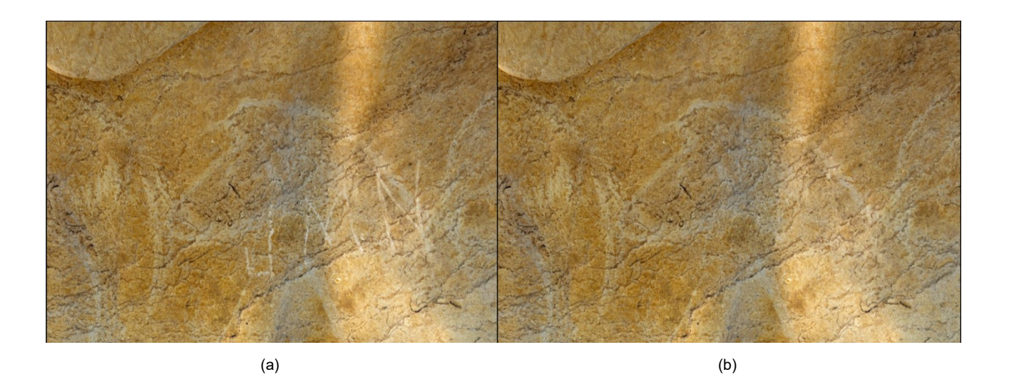
Figure 2: Examples of before (a) and after (b) virtual restoration of prehistoric glyphs, digitally removing modern graffiti.

(IAC, henceforth) (Clottes, 1993), it has only been in more recent times that a shift has occurred in the approach to studying activities surrounding Palaeolithic rock art, based on quantifiable data (Fazenda et al., 2017; Díaz-Andreu & Mattioli, 2019; Till, 2019; Medina-Alcaide, 2019; Jouteau et al., 2020; Fritz et al., 2021). This shift in research trend pays more attention to information from the context in which graphic manifestations are integrated (Medina-Alcaide et al., 2018), thus allowing the study of the artistic phenomenon in terms of sensory perception, as well as its economic and social implications, and not solely from a stylistic point of view (Garate, 2017; de Beaune, 2018).