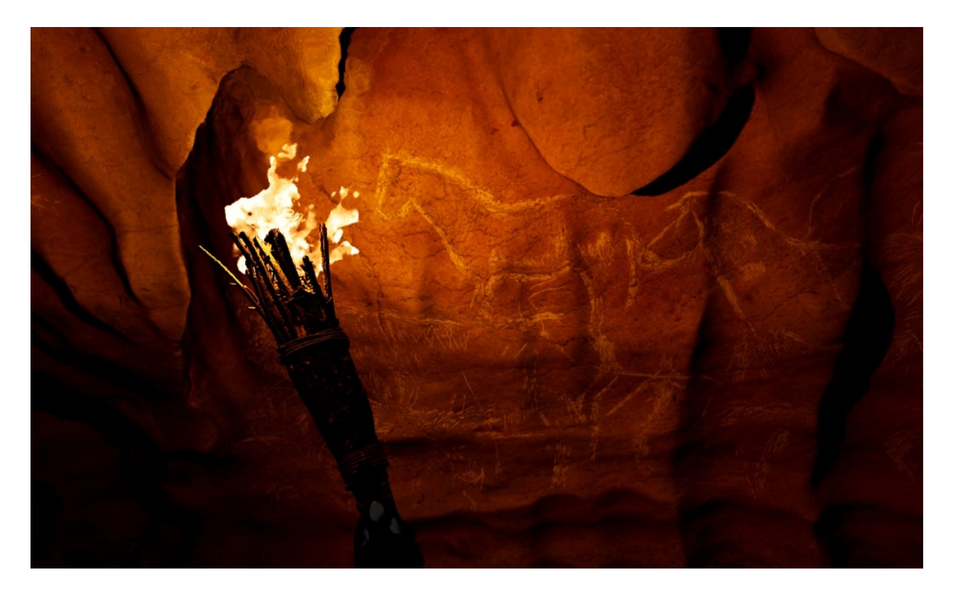
Figure 4: View of the real-time experience in SVR with using interactive torch lighting.

The first recreated lighting system is a torch (Fig. 4), corresponding to a small portion of reddened clay juxtaposed with charcoal remains found during the archaeological excavation of the ledge. Its small size and elongated shape (8.6 cm x 2.6 cm) suggest its use as a support for a torch or the combustion of a detached fragment from it. The torch becomes an interactive element for the viewer, as the VR user can hold and move it while traversing the ledge, thereby varying the environmental lighting in real time. This allows us to experience the actual visibility provided by the lighting systems used by the artists who decorated the cave of Atxurra.