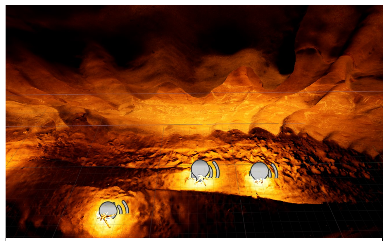
Figure 5: View of the graphic engine with the arrangement of the fixed fires on the ledge.

SVR has allowed us to reconstruct what the creation and/or observation scenario of Palaeolithic rock art in underground settings was like at a specific point in time. In this way, the ability to modify a large number of parameters and observe prehistoric engravings in their original state can promote sympathy (Moro-Abadia, 2009) with Palaeolithic artists and, consequently, the formulation of new hypotheses by researchers.