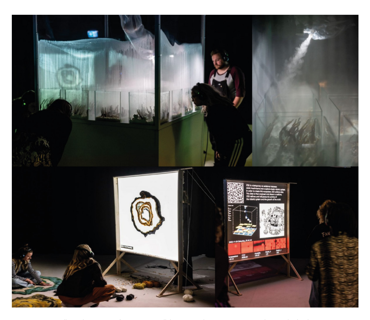
Figure 4. ZOE installation by Noor Stenfert Kroese in collaboration with Amir Bastan, Rotterdam, Netherlands. 2022.