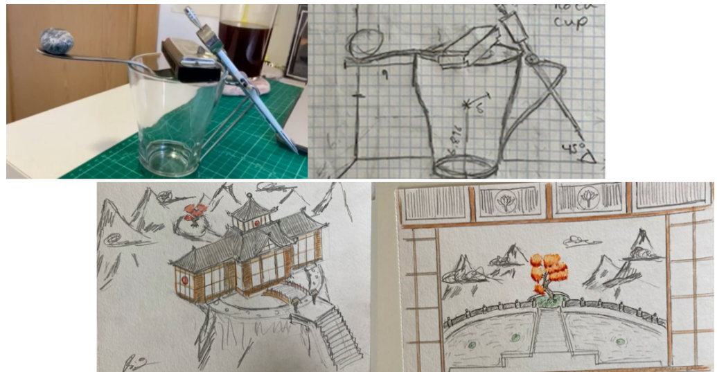
Figure 9. Thenjou.