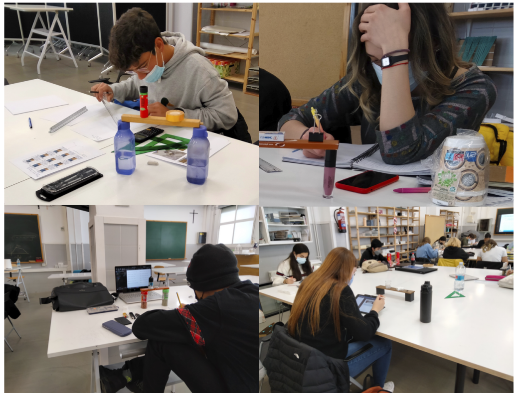
Figure 5. Students developing the bending equilibrium challenge.