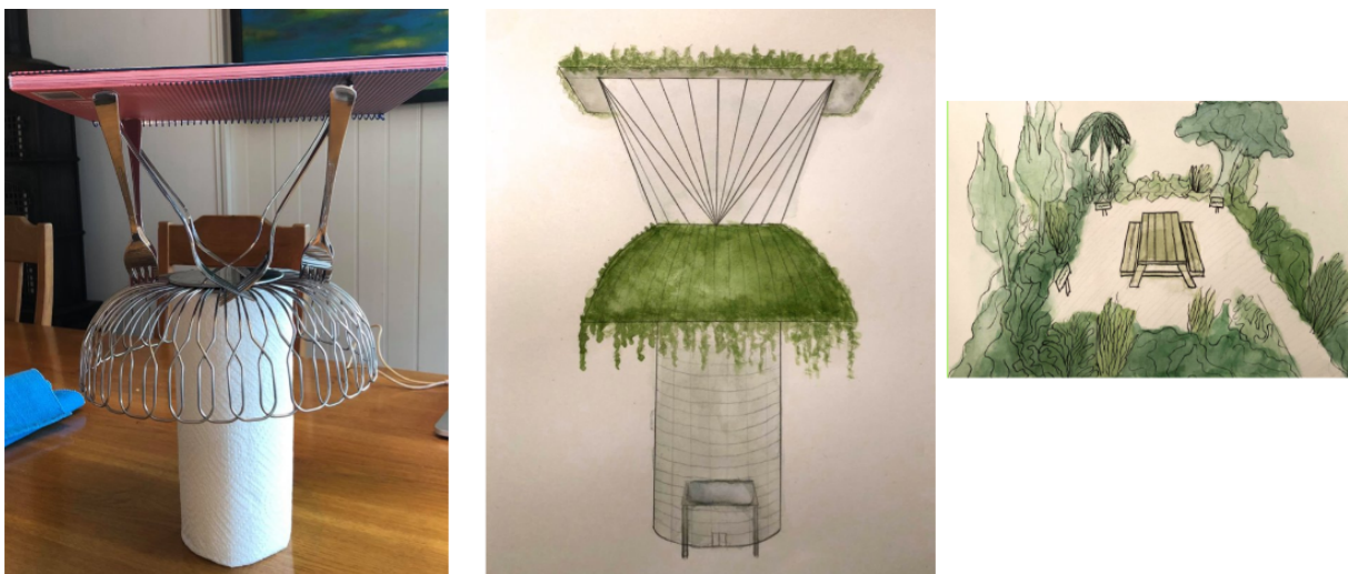
Figure 7. The Hanging Garden Conservatory.

This challenge will be carried out on Christmas holidays and therefore, students have two weeks to design their building. Figures 7–9 show three examples of the students' proposals.