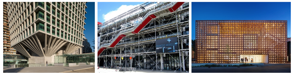
Figure 4. Examples of buildings whose structure can be seen: (left) Building Cruz del Sur, Chile (architects Izquierdo and Lehmann, (middle) Centre Pompidou, Paris (architects. R. Piano, R. Rogers), (right) Aspen Art Museum, USA (S. Ban).

The development of the challenge is specified below: