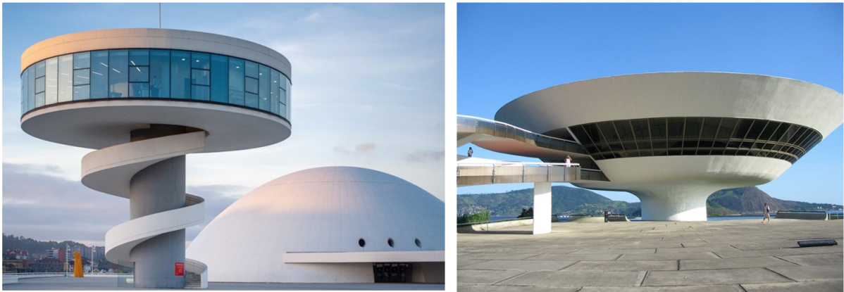
Figure 6. Examples of buildings whose original idea could involve the use of an equilibrium challenge, Oscar Niemeyer International Cultural Centre (Spain), Niterói Contemporary Art Museum, Brazil (Oscar Niemeyer).

Finally, students must draw their building, give it a name, design a logo and generate the storytelling of their project, to finally record a video in which they present the designed building and its main qualities. As it is a more complex and elaborate challenge, students will have two weeks to develop it.