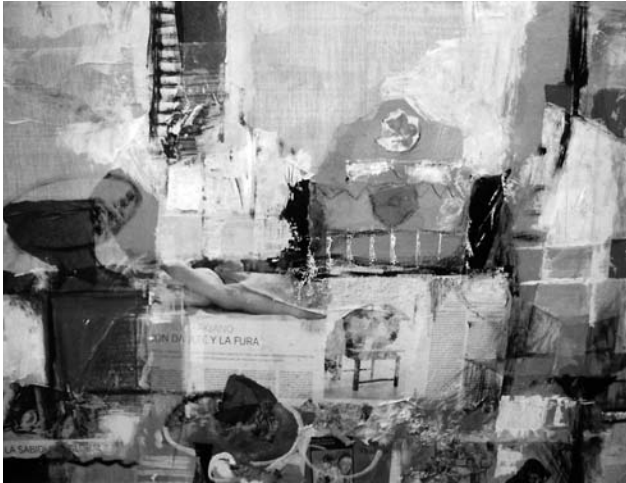
Figure 5.- Details of the composition of the work of Eduardo Sales