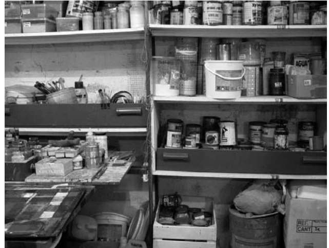
Figure 2.- Storage of the materials used by the artist.

relation to the conservation of his work and potential intervention. For this purpose, an interview was conducted on the first occasion we were with the artist in his studio to obtain information about his work standards, artistic intentions and personal evolution over the years. During this first phase of data collection, the fieldwork carried out in the artist's studio was assessed and considered to be a first-hand source of information. As the INCCA working group recommended, information is obtained with this method that will help us to make appropriate decisions by paying attention to the discrepant factors surrounding the conservation of contemporary art.