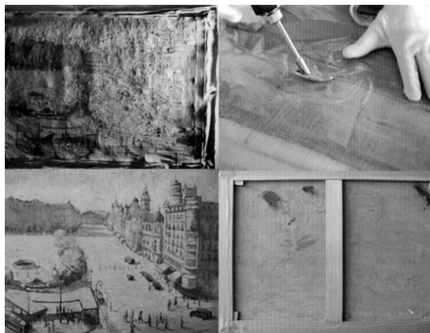
Figure 7.- Intervention process for the work Portrait (Retrato) .

Intervention began with a soft mechanical cleaning on the front and back of the work with brushes of varying hardnesses in order to remove the greasy dust deposits found, particularly in the folds that had formed on the perimeter of the canvas. In order to restore the work its planarity to correctly consolidate the pictorial layers, and since shrinkage of the support had not been confirmed, an impregnation process was carried out with Beva®371 in white spirit (1:1) on a layer of Japanese paper. Next, the work was taken to a heated table where the combination of controlled heat and pressure flattened the work, thus removing the deformations on the support. After cooling under pressure, strips were placed on the perimeters (since these areas were the most damaged and weakest that the