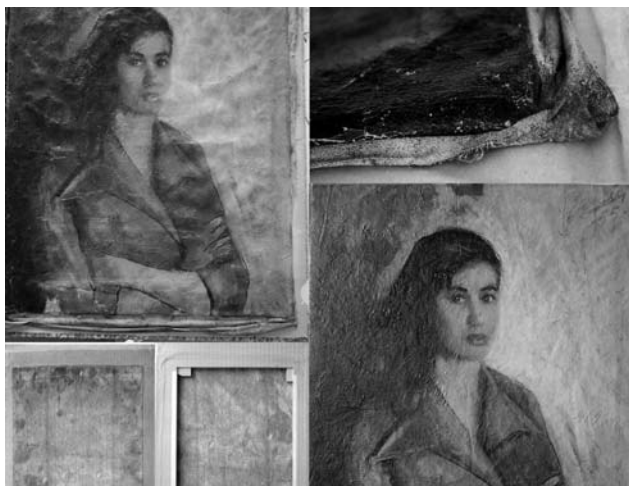
Figure 6.- Intervention process for the work Portrait (Retrato) .

essential information, this being the soul of the work, which is quite the opposite to what was done before when absolutely everything was repainted. Like what was done when restoring the Crucifix of Cimabue following the flood.