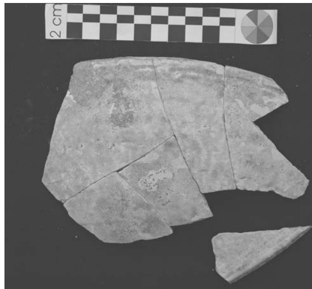
Figure 2. Ceramic glaze piece of Madinat al-Zahra style, 11 th Century. External side. Before restoration