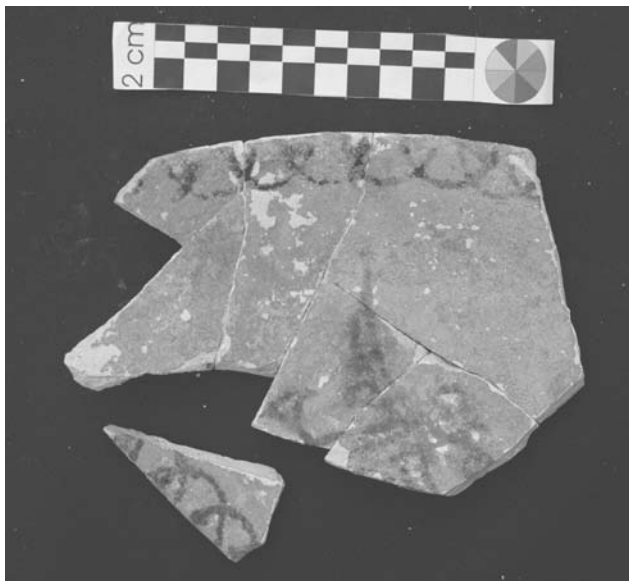
Figure 1. Ceramic glaze piece of Madinat al-Zahra style, 11 th Century. Side with the decoration in green and manganese. Before restoration