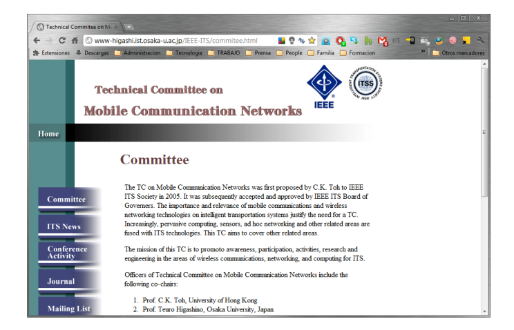
Figure 3: Snapshot of the TC on Mobile Communication Networks Webpage [source: http://www-higashi.ist.osaka-u.ac.jp/IEEE-ITS/].

In Europe, there have been a lot of integrated projects dealing with ITS funded by the European Commission under the EU FP6 (2002-2006), and FP7 that extents the program further till 2013, i.e.,: AIDE, AWAKE, CarTALK 2000, COM2REACT, COMUNICAR, CVIS, CyberCars2, eIMPACT, E-MERGE, Support, GST, HIGHWAY PREeVENT eSafety SAFESPOT, SEISS, SEVECOM, TRACE, or WATCH-OVER, and so on [10]. Also, ERTICO - ITS Europe was founded at the initiative of leading members of the European Commission, Ministries of Transport and the European Industry. It represents the interests and expertise of around 100 Partners involved in providing ITS and services, and facilitates the safe, secure, clean, efficient and comfortable mobility of people and goods in Europe through the widespread deployment of ITS. Our webpage provides several research projects and related links for FP7 and ERTICO - ITS Europe.