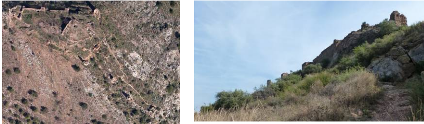
Fig. 1. Top view of the castle and general view of the northern wall of the upper enclosure.

Due to the scarcity of archaeological work on the complex, the castle has become a centre of interest for researchers. The first explorations on the hill found surface material attesting to the successive occupation of this site by inhabitants of the Chalcolithic and Bell Beaker Period, the Bronze Age, the Iberian Period, the Roman Period, and the Medieval Christian Period [4]. The structures currently visible are mainly Medieval and comprise the following: a palace zone on the top of the hill delimited by two wall sections and the remains of a third; an upper enclosure following the contours of the hill's upper platform and encompassing the palace with four wall sections and nine towers all still plainly visible; a lower enclosure following the stretched-out contours of the hill's lower part created by the remains of walls and towers [5]. The upper enclosure has more remains and therefore a great variety of construction techniques due to various expansion and repair activities over the centuries.