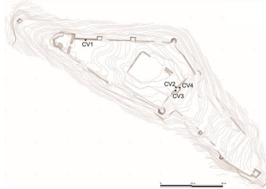
Fig. 4. Location of samples taken from defence walls and tower wall.

We have studied four samples from the outer facings of the defence and tower walls: CV1 is the brick-reinforced rammed-earth type, and CV2, CV3, and CV4 are lime-crusted types (fig. 4).