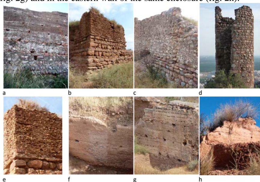
Fig. 2. Construction techniques at the Castle of Villavieja: masonry base and rammed-earth wall (a and b), masonry wall (c and d), lime-crusted rammed-earth wall (e and f), and brick-reinforced rammed-earth wall (g and h).

The castle walls mainly consist of masonry and rammed earth. But each of these techniques appears in a wide range of variations as to materials used and the type of execution (fig. 2). The types of masonry include: formwork masonry in a herringbone pattern with river rocks at the base of the north wall section in the upper enclosure (fig. 2a); masonry with courses of rough-hewn stone at the base of the central tower in the eastern wall of the upper enclosure (fig. 2b); formwork masonry in the palace zone walls (fig. 2c); masonry with rubble and river rocks in ten of the visible towers, six in the upper enclosure and four in the lower enclosure (fig. 2d). In addition, the rammed-earth technique has several variants in the castle: the lime-crusted rammed earth wall with more (fig. 2e) or less (fig. 2f) erosion of the outer lime layer in the eastern and southern wall sections of the upper enclosure and four towers therein; brick-reinforced rammed earth at the western end of the northern wall in the upper enclosure (fig. 2g) and in the eastern wall of the same enclosure (fig. 2h).