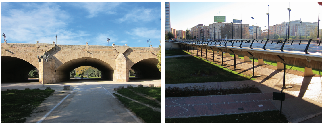
Figure 3. Left: Puente del Real. Right: Puente 9 de Octubre

The purpose of this field trip is to analyse and compare the forms of the four selected bridges, as four different responses given at different points of time to a common environment, each one with its specific functional, constructive and structural conditions and requirements. One important point is to show real examples of built works, which can be seen, touched and walked around, whose form can be understood as a synthesis of different conditioning aspects. Students are therefore encouraged to observe the works and wonder about the different influencing factors that explain their built form.