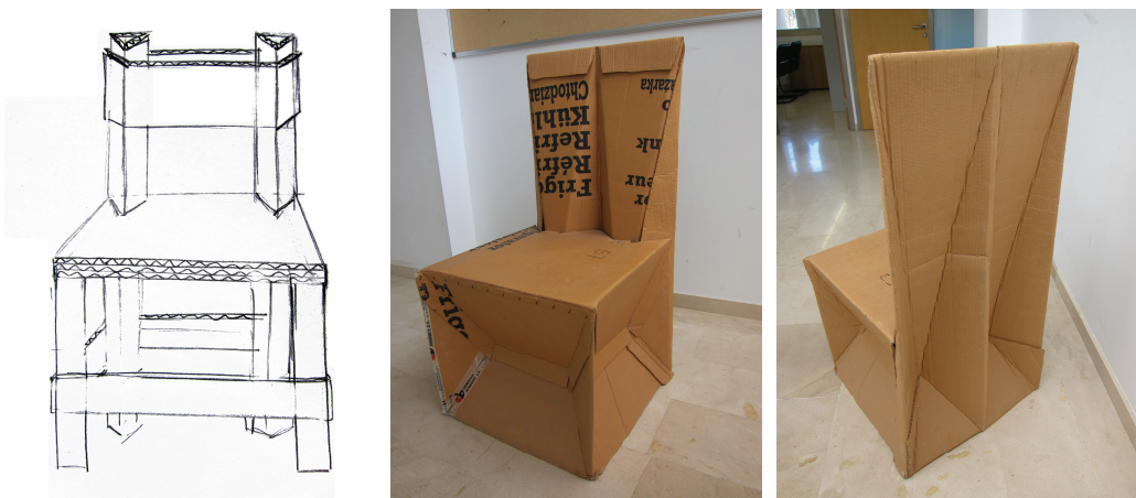
Figure 1. Left: typical student design for a cardboard chair. Right: real built cardboard chair.

Students are asked to design a chair to be built only with doubly layered corrugated cardboard and glue. The chair must include a back, and should support a heavy person (about 100 kg) sitting on it and leaning on its back. The purpose of the exercise is to grasp the link between form and strength. Students must find the most suitable forms to build the chair with the least amount of material and maximum strength. As cardboard is an unusual material to build a chair, there are no known forms available, and this compels students to explore the behaviour of cardboard to get maximum strength from it. They usually find that folding cardboard to produce sharp edges as in a triangular prism is an effective way to obtain strong forms. So, most designs show a tendency to adapt these prismatic forms to the well known traditional four legged chair, keeping that overall pattern, and designing cardboard legs with triangular prisms.