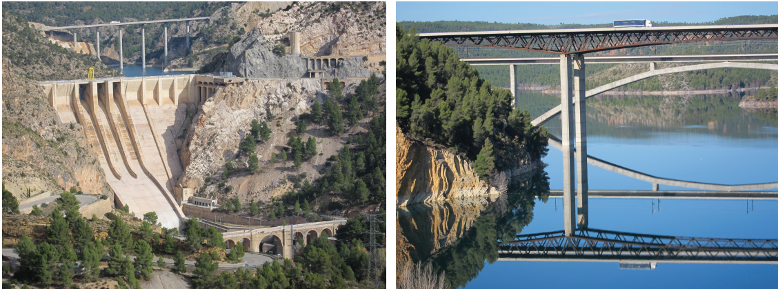
Figure 4. Contreras area. 19th century road and arch bridge, dam, motorway and high-speed train viaducts

The deep gorges of the river Cabriel in the Contreras area are an important natural obstacle on the shortest route between Madrid and Valencia. Different passage ways have followed one another over the centuries on this area, and a dam was built in one of the narrowest gorges to produce a reservoir for water supply, irrigation and hydroelectric purposes. The result is a high concentration of different types of public works belonging to different periods of history on the area: the stone bridge and winding road built in 1851, the N-III road running along the top of the dam (1974), the viaducts for the A3 motorway (1999) and the viaducts for the high-speed train (2011). The area is therefore considered of high didactic interest to analyse and compare the forms of all these works, built with different materials and structural types, in a remarkable rural setting, where nature and engineering come together to create a landscape of great value as natural, cultural and built heritage.