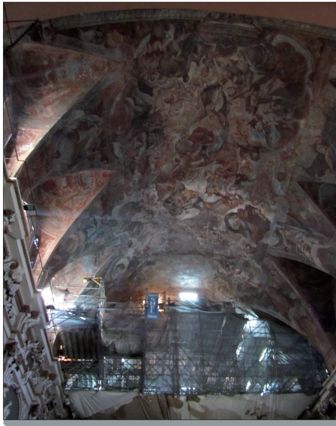
Figure 1. Image of the wall paintings on the central vault of the Santos Juanes Church in Valencia, Spain.

This inadequate restoration produced many different problems to the frescoes, being one of them the incorrect removal of animal glue used during the strappo . Any attempts to remove this animal glue using traditional techniques have been unsuccessful. The research presented in this article shows an alternative method, based on the use of viable bacteria, to clean old and encrusted animal glue on wall paintings.