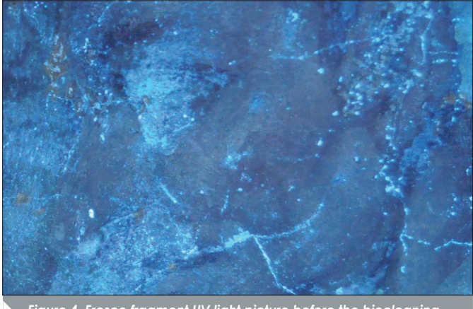
Figure 4. Fresco fragment UV light picture before the biocleaning treatment.

At the same time no significant differences were found between treated and not treated areas (100URL and 2CFU). These results show that this kind of biocleaning procedure is safe and risk-free when treating wall paintings. Analyses have been carried out to determine the bacterial solution quantity needed to bioclean animal glue present on wall paintings. Our analyses conclude that an average of 0,2L of bacterial solution is needed to clean one square meter of wall paintings, using agar as a carrier. Previous studies showed that 2L bacterial solution was needed to clean one square meter of wall paintings when using cotton as a carrier (20), this implies that agar reduces ten times the required bacteria what has an important economical repercussion on the technique and supports the growing evidence of the benefits of using agar instead of cotton as a biocleaning carrier. This work proves once again that biotechnologies applied to restoration of cultural heritage are a successful approach. It presents a correct biological case of animal glue cleaning from 18<sup>th</sup> century frescoes with short term application of P. stutzeri DSMZ 5190 and agar.