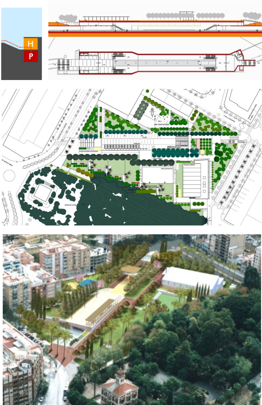
Figure 3: Ayora Station. Metro Line 5, Valencia.