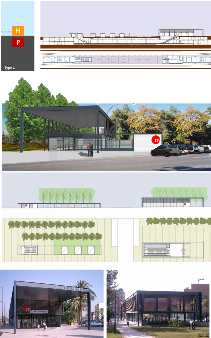
Figure 4: Metro stations. Line 5, Valencia, West branch.