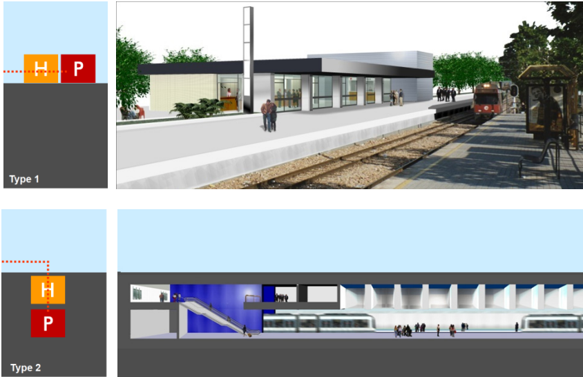
Figure 1: Access typologies in metro stations (H: hallway. P: platforms). Type 1: Seminar Station. Metro Line 1, Valencia. Type 2: Joaquín Sorolla Station. Metro Line 1, Valencia.

While the metropolitan railway runs on ground level, as in the peripheral or peri-urban areas of large cities, stations are buildings, clearly identifiable as an architectural volume, where we enter on one side, buy the ticket in the hallway, and exit on the opposite side to the platforms to board the subway wagon (Fig.1, Type 1).