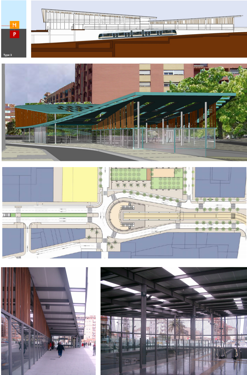
Figure 5: Marítimo-Serrería Station. Metro Line 5 Valencia, east branch.