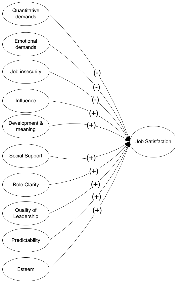
Figure 1.- Integrating model of the effect of working conditions on job satisfaction.