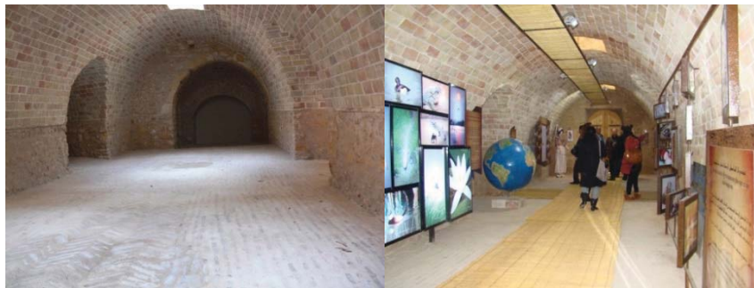
Figure 2: Tunisian Wetlands Room before and after the adaptation to modern use.

The interpretation centre is located in the opposite tower to the main entrance. The total available area for the exhibition is 227 m 2 , divided into 2 main rooms of 100 m 2 each ('Tunisian Wetlands Room' and 'Ghar El Melh Room') plus a small space of 27 m 2 that hosts the visitor information point (fig. 2). These two large rooms house 14 exhibition stations that present the wetlands in Tunisia, including the related social and economic activities. There is also a 'Hall of Pirates', which traces the history of piracy in the region. A very easy sequential touring pattern has been established to avoid crowding and a minimal number of groups encountered (fig. 3).