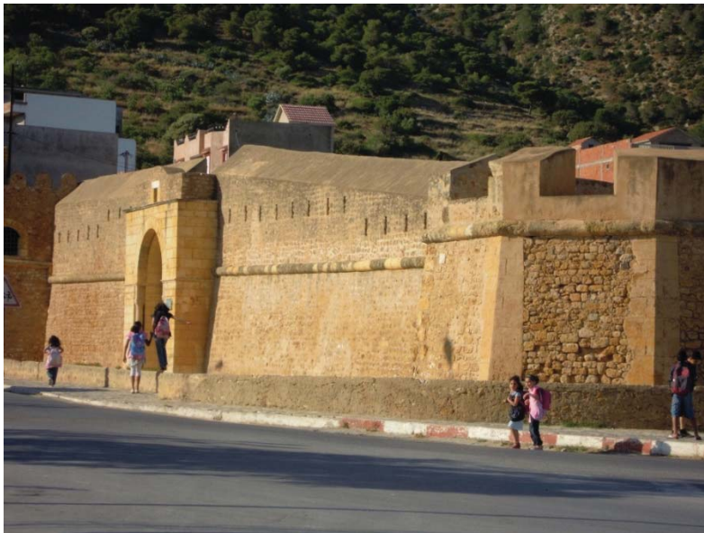
Figure 1: Ottoman Fort of Borj El Loutani (Ghar El Melh, Tunisia).

This area has a long history linked to the maritime civilisations that date back to the Phoenicians who founded the town of Rusucmona (slightly inland from the present one) and the Utica port. During Carthaginian and Roman times, the area was known as Porto Farina. In those periods, the coastline and lagoon configuration were different; the area existed as a wide gulf (Utique Sea) that evolved into a lagoon due to the infilling of the alluvia of the Medjerda River [6]. In the 13th century, the town started to decline and suffered ups and downs due to Berber and Byzantines pirates until the occupation of the Vandals in the 16th century, becoming a stronghold for Saracen pirates.