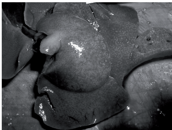
Figure 1: Liver. Hepatomegaly and haemorrhage on the surface.