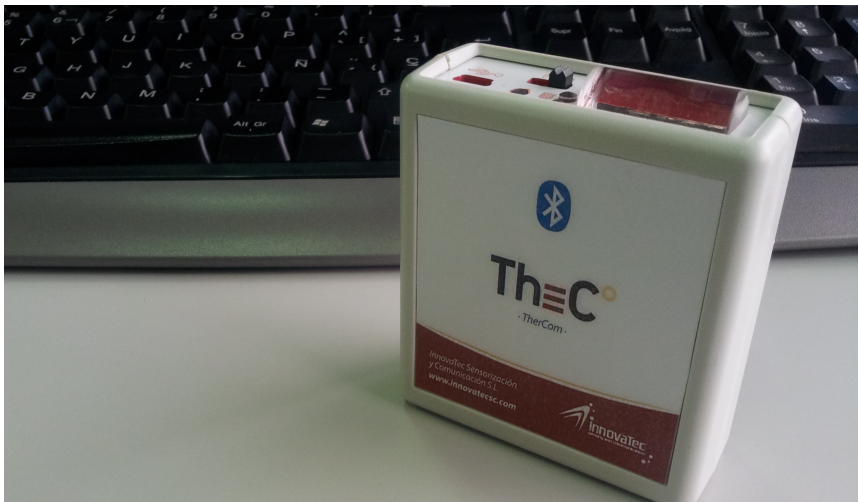
Fig. 2 Image of the actual device. Probes are connected using the sockets at the bottom of the device. At the top, the display, on-off switch, USB connector, LEDs, and interaction button are located.