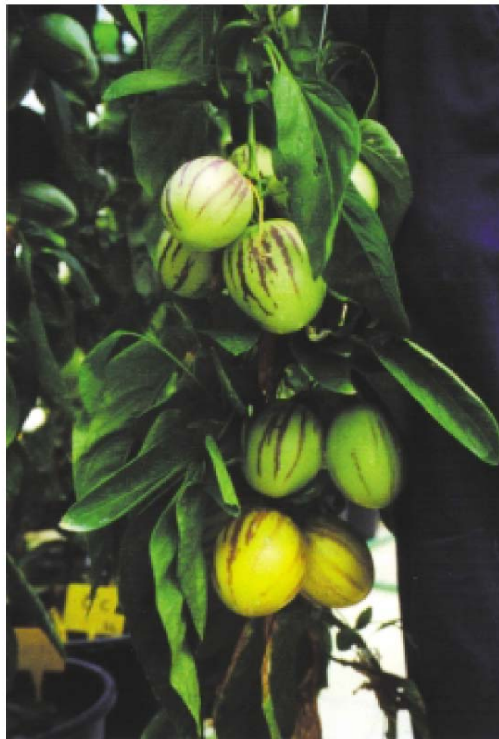
Fig. 2. Turia vine in which the ripening sequence of fruits can be observed: ripe fruits (lower cluster) and unripe full sized fruits (higher clusters).

ENVIRONMENTAL REQUIREMENTS. Turia is well adapted to greenhouse cultivation. A range of temperatures from 10 to 25°C is the optimum for the development of plants and for achieving maximum yields. Although plants can resist light frosts (up to -2°C), temperatures below 10°C cause growth retardation. On the other hand, temperatures above 30°C induce luxurious vegetative growth, which competes with fruit set, and decreases fruit quality, manifested in a reduction in the soluble solids content. Relative humidities above 70% (common in greenhouses) favour pollination and fruit set of this cultivar. Turia can flower and set fruits all year round, although flowering is stimulated by high light intensity and moderate temperatures (below 25°C).