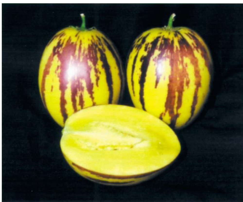
Fig. 3. Turia fruits.