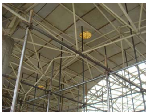
Figure 3-c some members buckled under compression