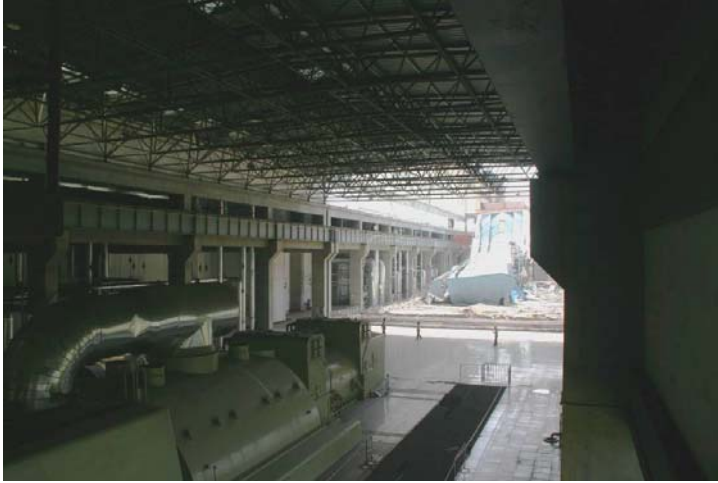
Figure 4-a the mechanical factory in Jiangyou, half collapsed