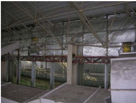
Figure 2-d: (→) member failed under tension forces