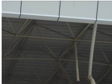
Figure 2-e: (↑) Failure between members and connectors