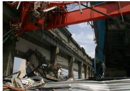
Figure 4-c collapsed sector-Integral collapse

Figure 4-d~e shows collapse of concrete roof plate