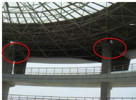
Figure 3-b struts close to supporters failed