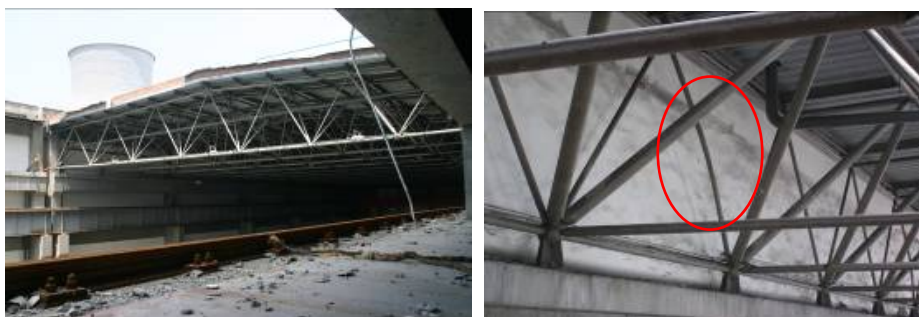
Figure 4-p: (↑) neighbored grid roof intact