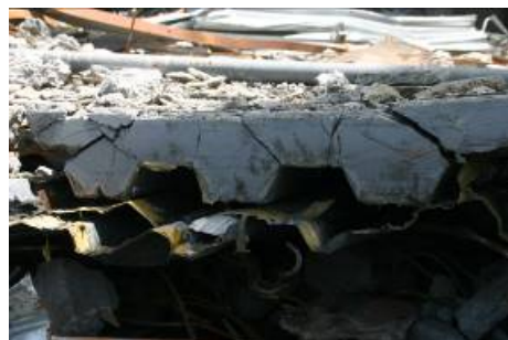
Figure 4-e concrete plates fell