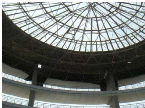
Figure 3-a A grid shell in Mianyang