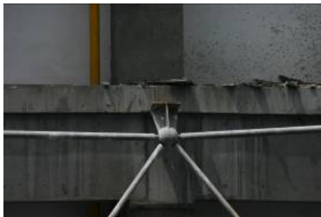
Figure 4-h: (↑) Supporters and the connected members (2) Figure 4-j: (→) Supporters and the connected members (3)