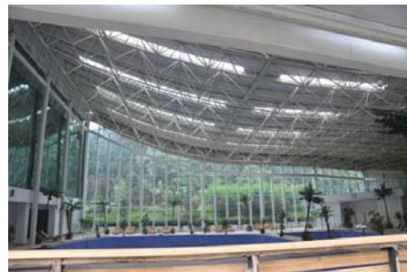
Figure 2-b: internal space

Fig. 2-a~g show a damaged grid shell in Dujiangyan. We can find some members close to supporters are buckled under pressure or yielded under tension. The earthquake resistance intensity of Dujiangyan is 7 and so earthquake effects can be ignored in this city according to stipulations of Chinese code. But in Wenchuan earthquake, the earthquake intensity