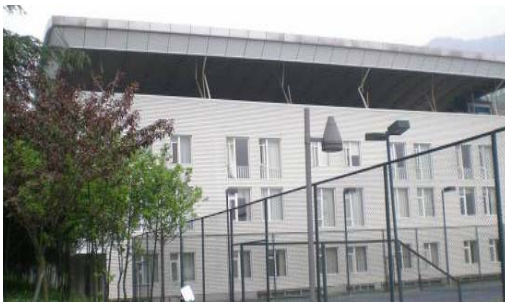
Figure 2-a: A grid shell in Dujiangyan