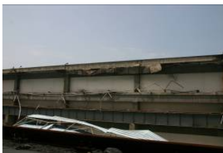
Figure 4-f: (↑) Louver collapsed at the middle part Figure 4-g: (→) Supporters and the connected members (1)