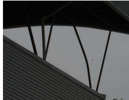
Figure 2-c: (↑) member failed under tension forces