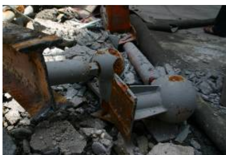
Figure 4-k: (↑) members and nodes fell down on the ground (1) Figure 4-m: (→) members and nodes fell down on the ground (2)