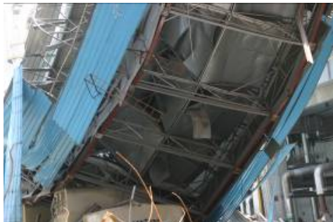
Figure 4-f~q show other pictures of this factory