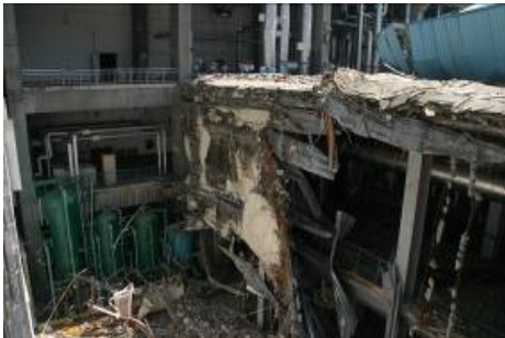
Figure 43-d concrete plates as roof covering

Figure 4-d~e shows collapse of concrete roof plate