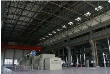
Figure 4-b the intact sector