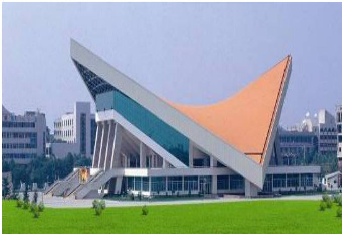
Figure 1: Deyang Gym with a hyperbolic saddle roof; grid shell used here with welding connection; no damages to the main structure, only ceiling damaged and infilling walls cracked partially

Because of their light weight, light weighted grid structures suffered only small damages. Through the investigation, we found only several of them were damaged but not collapsed. The typical damage patterns include strut buckling, connector failure, and roof plate falling.