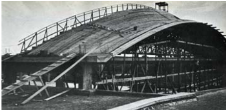
Fig. 7 Construction of the formwork of one of Dieste’s vaults. (Dieste [8])

On another opportunity Candela commented that “any development that saves money and effort in construction contributes more to the general well being of mankind than all the messianic claims so common in the profession” (Candela [7]). Candela was able to achieve economy of construction by using straight wood boards for the scaffolding and form boards to generate doubly curved surfaces; such is one advantage of using the hyperbolic paraboloid geometric shape. For example, Figure 3b shows the straight board falsework that was used to build Chapel Lomas de Cuernavaca. Unlike Candela, Dieste used curved formwork for his brick masonry vaults. He was able to achieve economy by reusing them about ten to twenty times to construct the series of vaults (Pedreschi [16]). The construction of the formwork for his Gaussian vaults is shown in Figure 7.