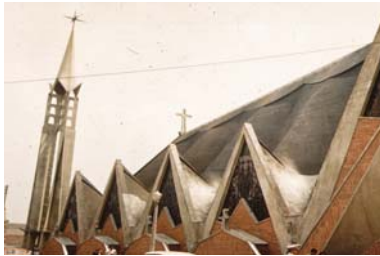
Figure 2: Our Lady of the Miraculous Medal Church by Candela