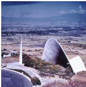
(a) aerial view

Efficiency means the search for forms that use a minimum of materials consistent with sound performance and assured safety. Dieste and Candela believed in strength through form and the forms were the basis for efficiency, economy, and elegance. Each favored a geometric shape in their works: Candela favored the hyperbolic paraboloid and Dieste the barrel or the Gaussian vault. While Candela used reinforced concrete in his designs and Dieste used reinforced brick masonry, both designed light thin shell structures without wasting materials since the form was efficient and proper. This section describes the geometric forms that were favored by Candela and Dieste, provides a brief discussion of the materials used for construction, and then illustrates the structure's performance and safety.