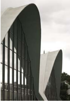
Figure 8: Candela's Bacardi Rum Factory.