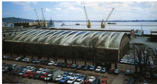
Figure 6b: Dieste's Port Warehouse showing the Gaussian Vaults (Anderson [1]).

Both brick masonry and concrete have excellent strength in compression and relatively no strength in tension. Therefore, both Candela and Dieste used steel bars to reinforce the concrete and brick masonry. Candela did not speak of reinforced concrete as a ‘choice’. For his shell forms, reinforced concrete was the only choice, perhaps for practical reasons related to cost and construction as well as the Mexican context.