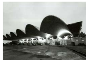
Figure 5: Dieste’s municipal bus terminal in Salto (Anderson [1]).