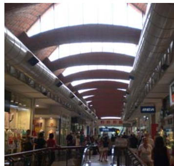
(b) inside view