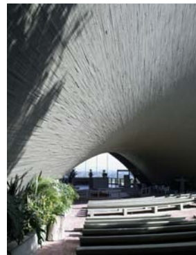
(c) inside view