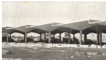
Figure 4: Candela’s umbrellas: A sketch showing straight lines generating the surface and Rio’s warehouse (right) under construction.