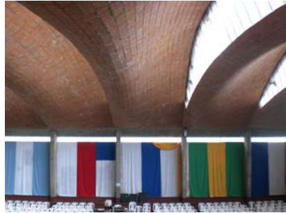
Figure 9: Interior of Dieste's Gimnasio Hno. Artigas de Agostini.