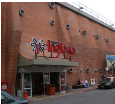
(a) Outside view

This paper begins by briefly examining Dieste and Candela’s early careers and the experiences and education that prepared them to become shell builders. Then Dieste’s and Candela’s works are discussed and compared in the context of efficiency, economy, and elegance.